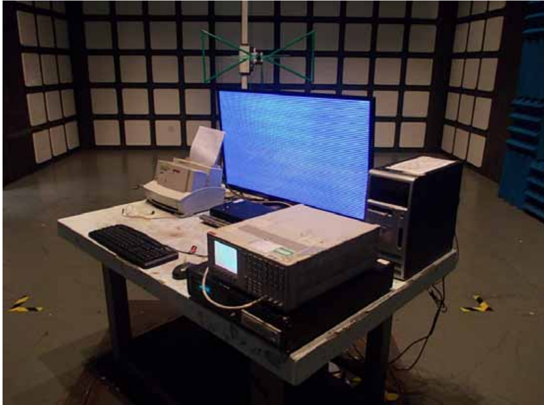
SETUP WITH MAXIMUM DETECTED EMISSION AT HORIZONTAL POLARIZATION (TEST MODE: D-SUB 1024*768@60Hz)