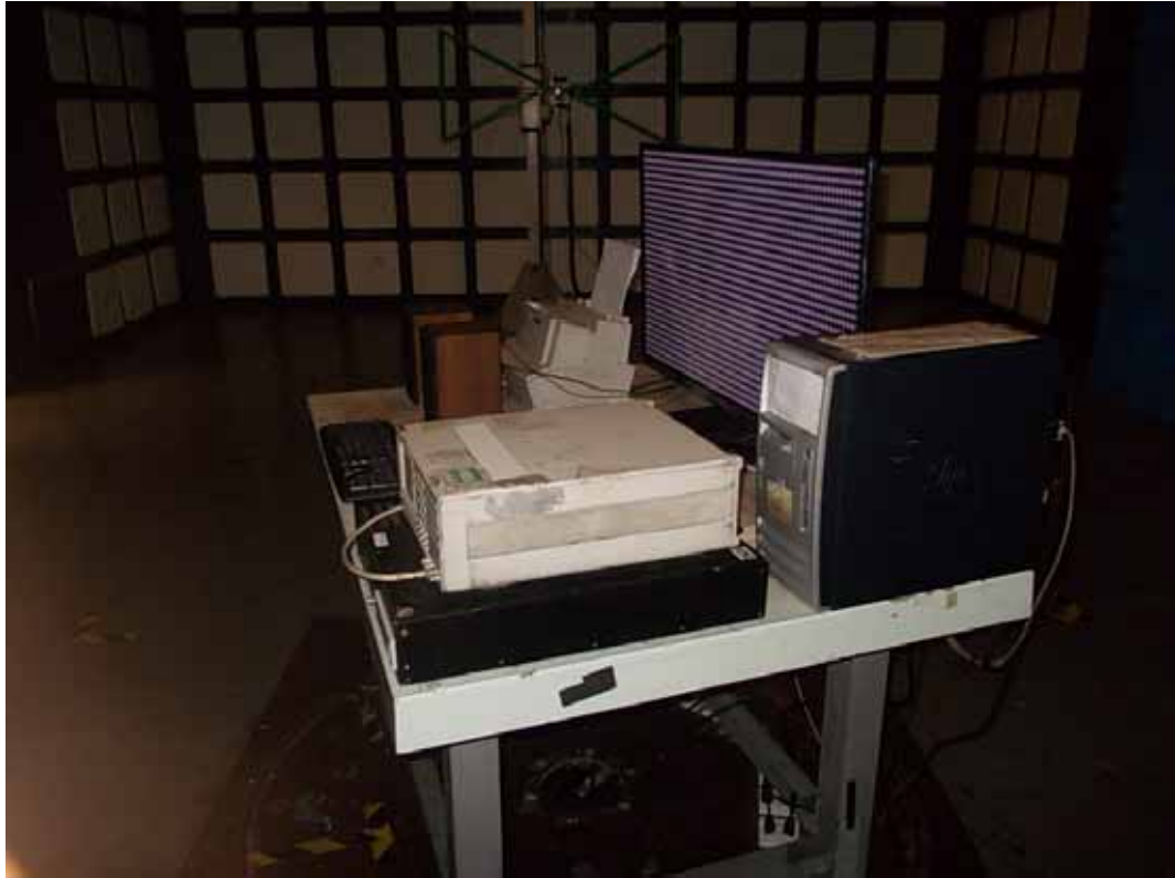
SETUP WITH MAXIMUM DETECTED EMISSION AT HORIZONTAL POLARIZATION (TEST MODE: HDMI 1920*1080@60Hz)