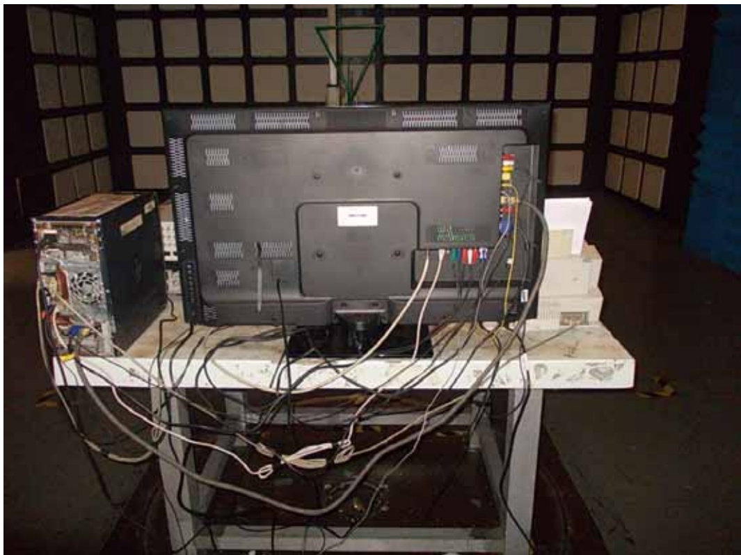
BACK VIEW OF RADIATED EMISSION TEST