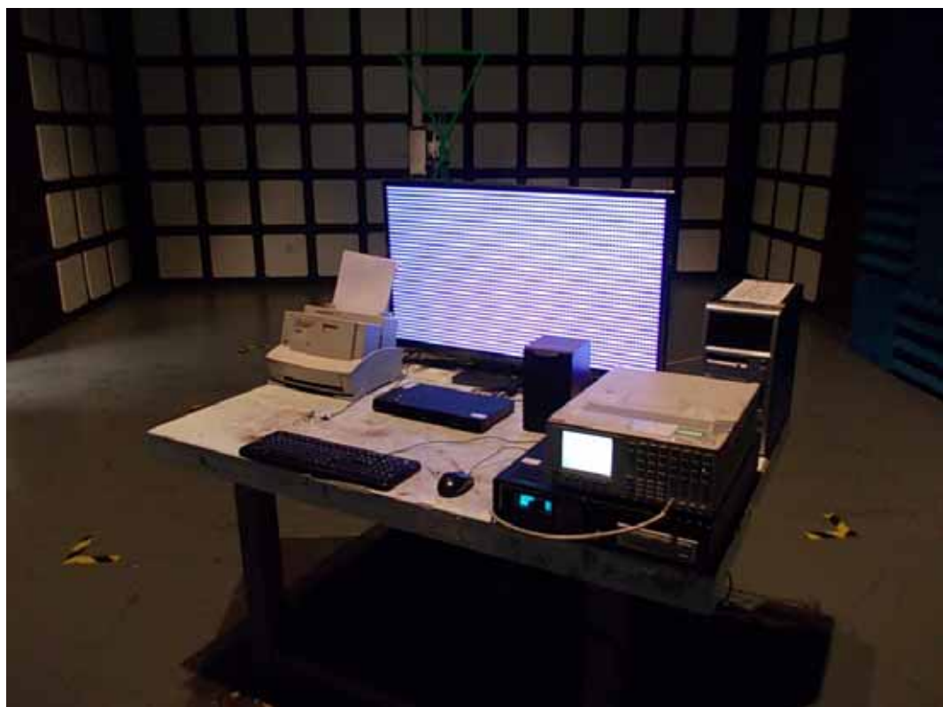
SETUP WITH MAXIMUM DETECTED EMISSION AT VERTICAL POLARIZATION (TEST MODE: D-SUB 1024*768@60Hz)