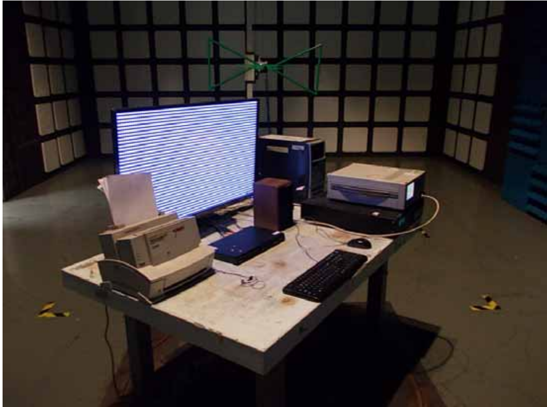
SETUP WITH MAXIMUM DETECTED EMISSION AT HORIZONTAL POLARIZATION (TEST MODE: D-SUB 1024*768@60Hz)