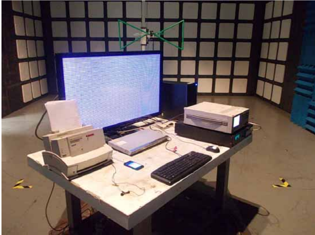
SETUP WITH MAXIMUM DETECTED EMISSION AT HORIZONTAL POLARIZATION (TEST MODE: D-SUB 1024*768@60Hz)