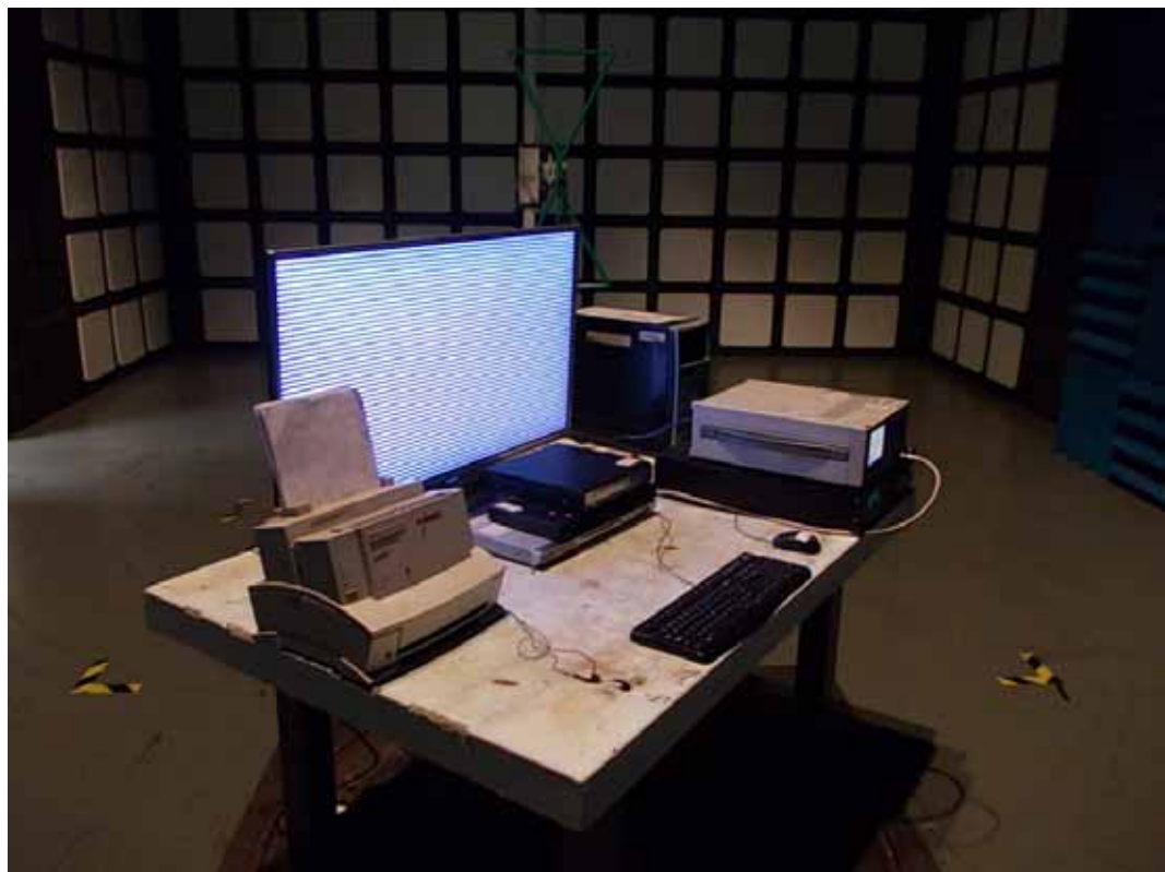
SETUP WITH MAXIMUM DETECTED EMISSION AT VERTICAL POLARIZATION (TEST MODE: D-SUB 640*480@60Hz)