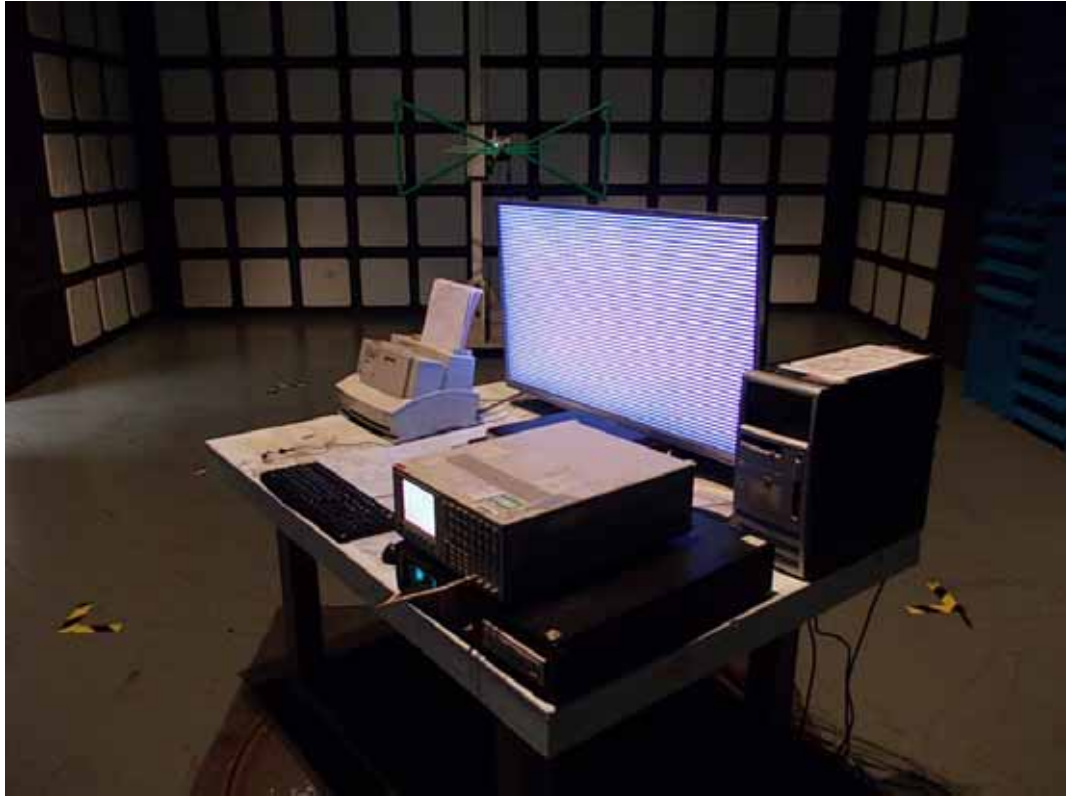
SETUP WITH MAXIMUM DETECTED EMISSION AT HORIZONTAL POLARIZATION (TEST MODE: D-SUB 640*480@60Hz)