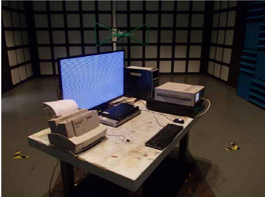
SETUP WITH MAXIMUM DETECTED EMISSION AT HORIZONTAL POLARIZATION (TEST MODE: HDMI 640*480@60Hz)