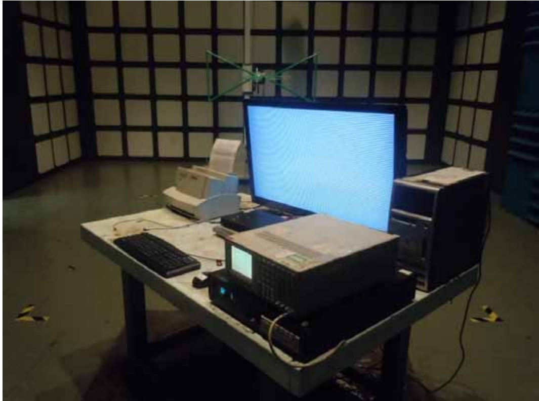
SETUP WITH MAXIMUM DETECTED EMISSION AT HORIZONTAL POLARIZATION (TEST MODE: D-SUB 1024*768@60Hz)