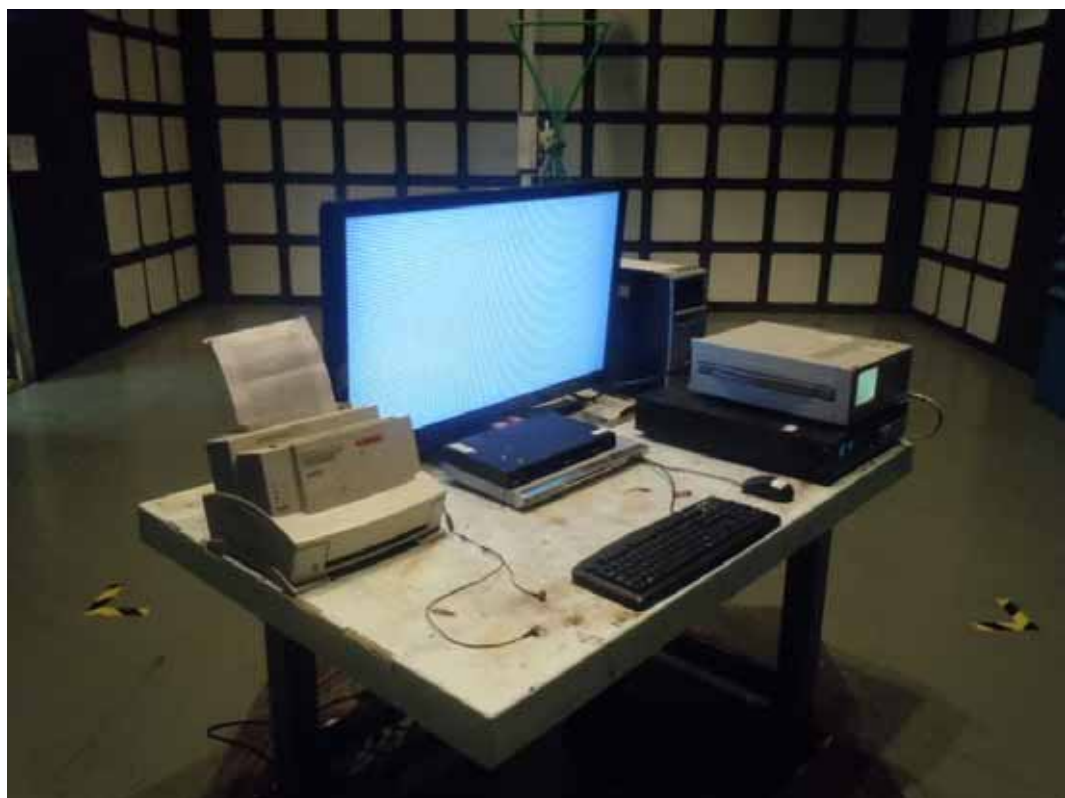
SETUP WITH MAXIMUM DETECTED EMISSION AT VERTICAL POLARIZATION (TEST MODE: D-SUB 1024*768@60Hz)