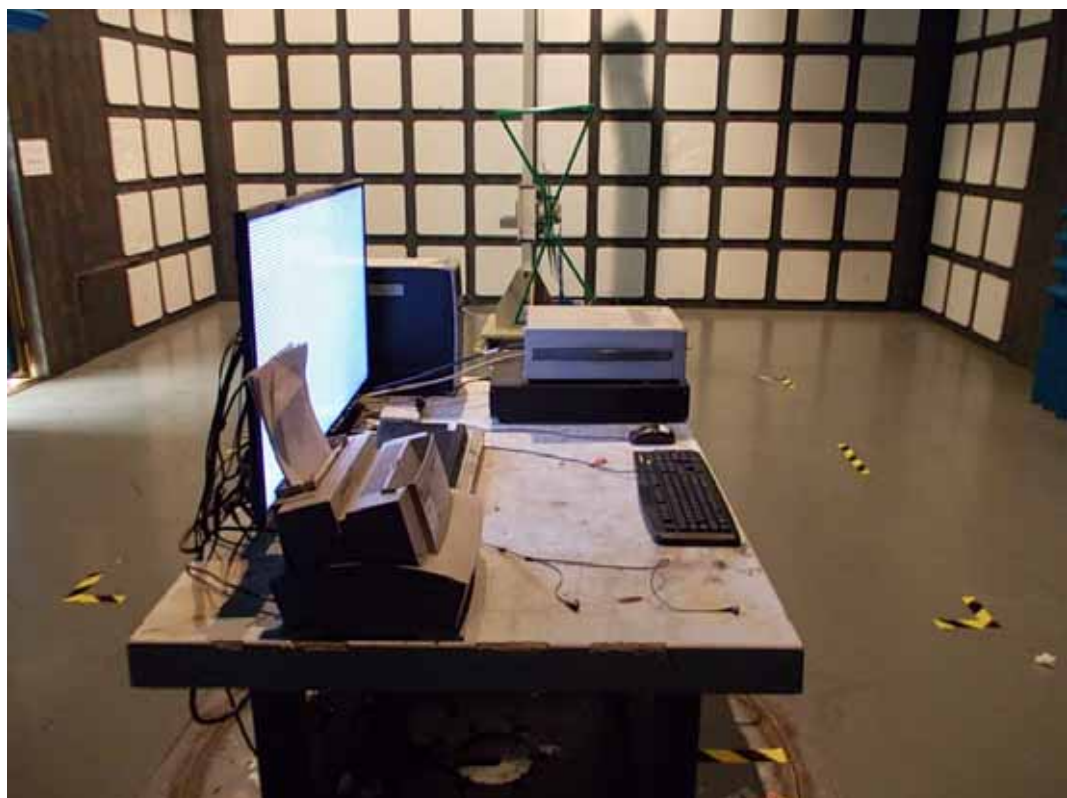
SETUP WITH MAXIMUM DETECTED EMISSION AT VERTICAL POLARIZATION (TEST MODE: D-SUB 640*480@60Hz)