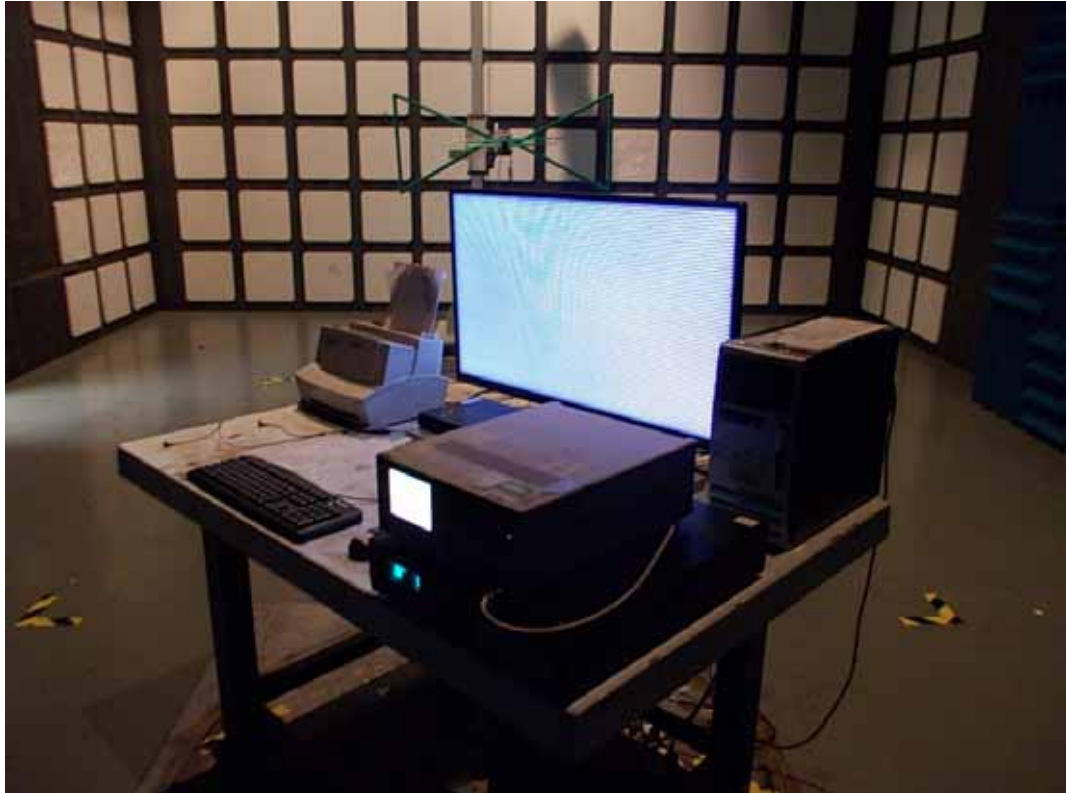
SETUP WITH MAXIMUM DETECTED EMISSION AT HORIZONTAL POLARIZATION (TEST MODE: D-SUB 640*480@60Hz)