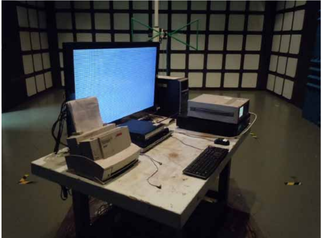
SETUP WITH MAXIMUM DETECTED EMISSION AT HORIZONTAL POLARIZATION (TEST MODE: D-SUB 1024*768@60Hz)