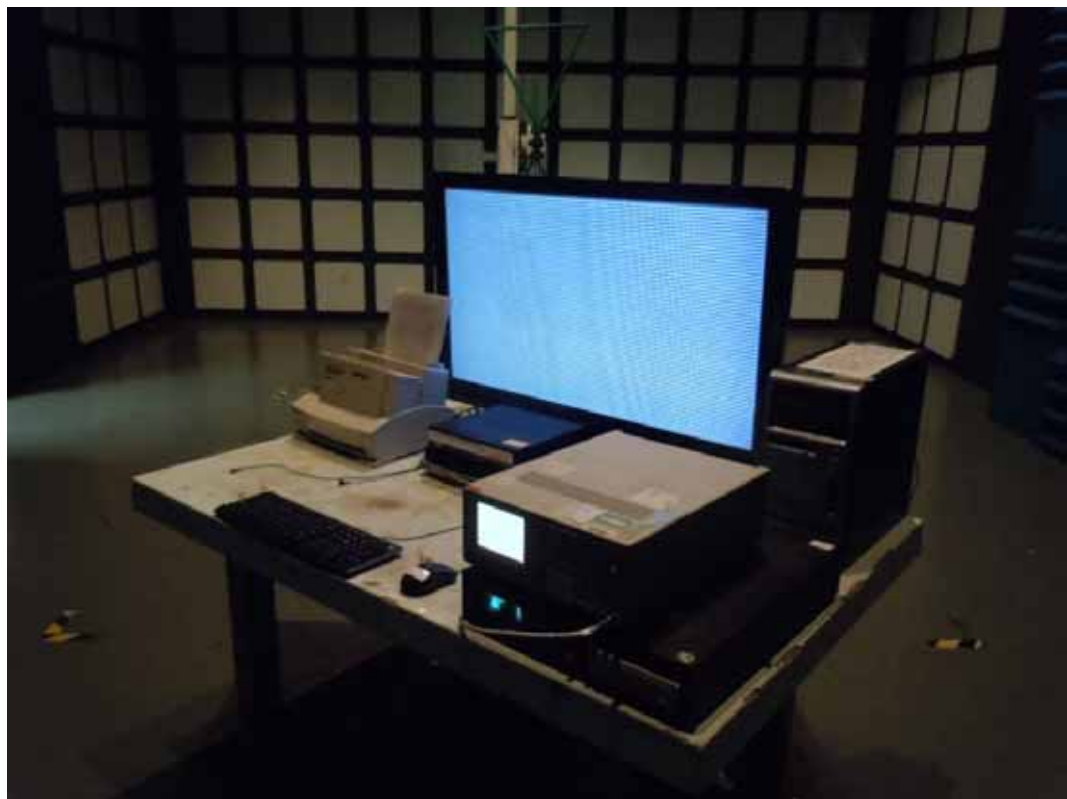
SETUP WITH MAXIMUM DETECTED EMISSION AT VERTICAL POLARIZATION (TEST MODE: D-SUB 1024*768@60Hz)