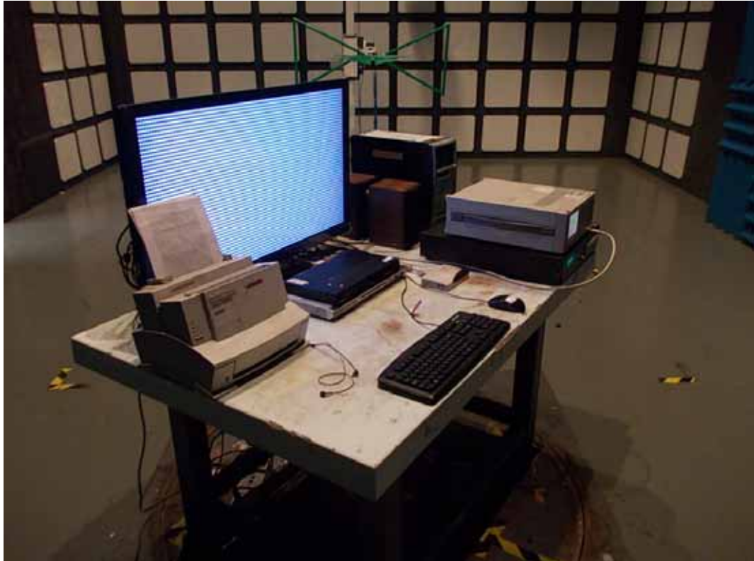
SETUP WITH MAXIMUM DETECTED EMISSION AT HORIZONTAL POLARIZATION (TEST MODE: D-SUB 1024*768@60Hz)