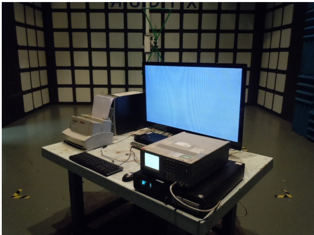
SETUP WITH MAXIMUM DETECTED EMISSION AT VERTICAL POLARIZATION (TEST MODE: D-SUB 640*480@60Hz)