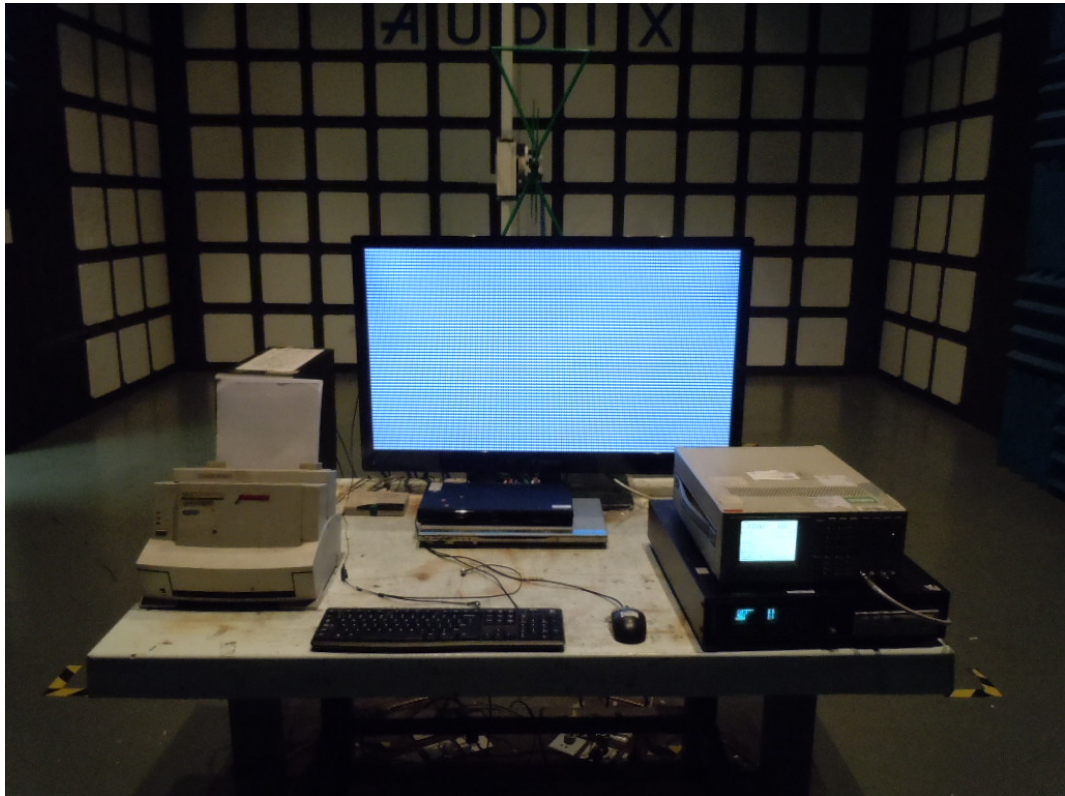
FRONT VIEW OF RADIATED EMISSION TEST