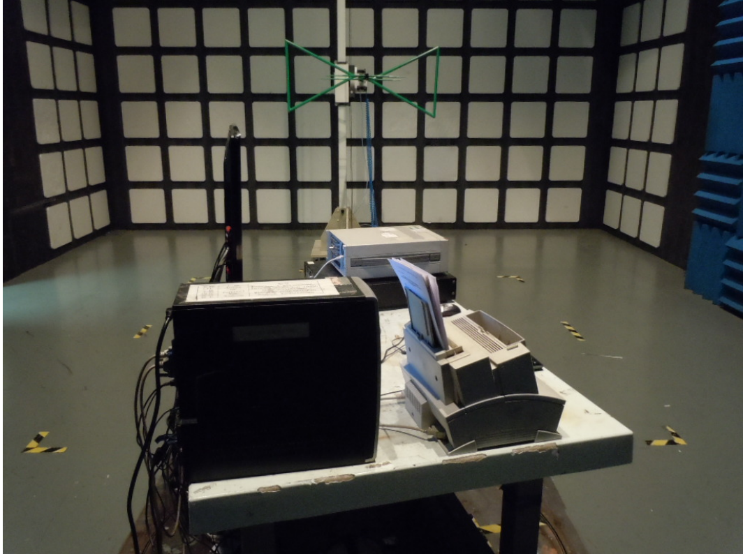
SETUP WITH MAXIMUM DETECTED EMISSION AT HORIZONTAL POLARIZATION (TEST MODE: D-SUB 640*480@60Hz)