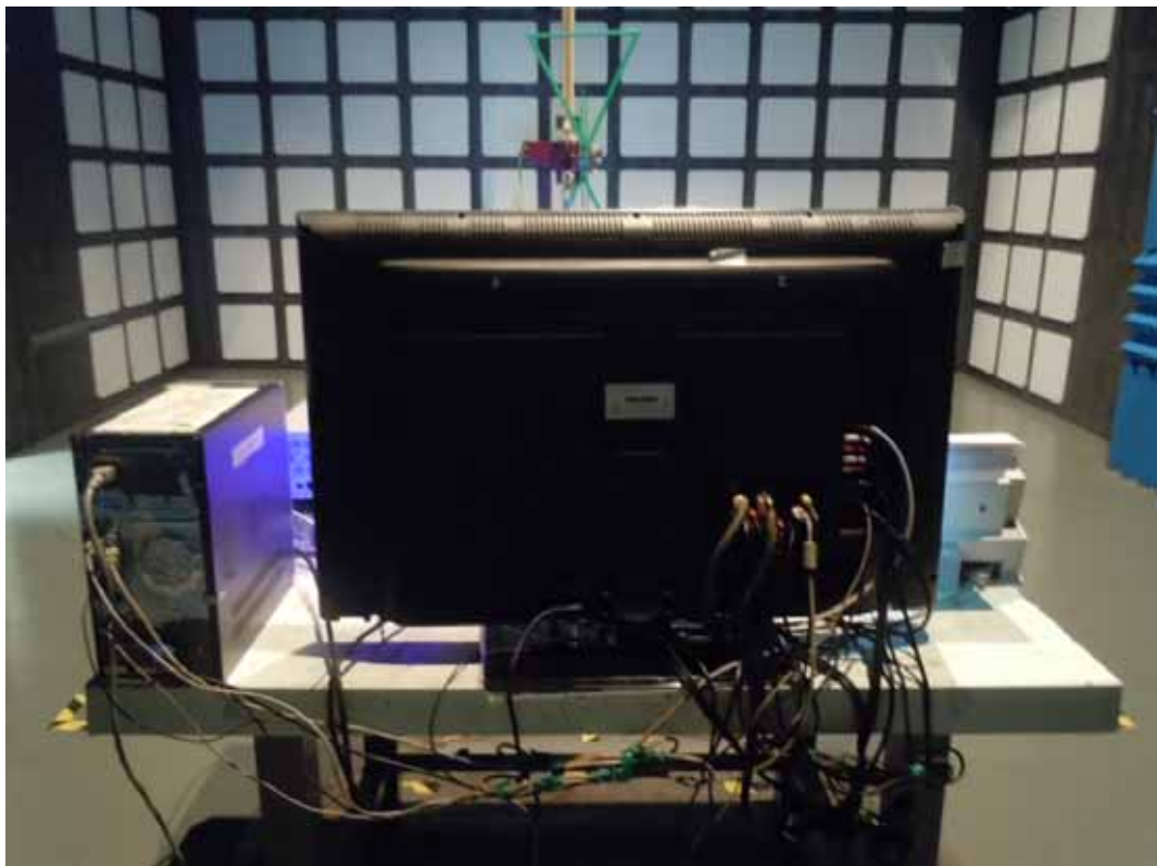
BACK VIEW OF RADIATED EMISSION TEST