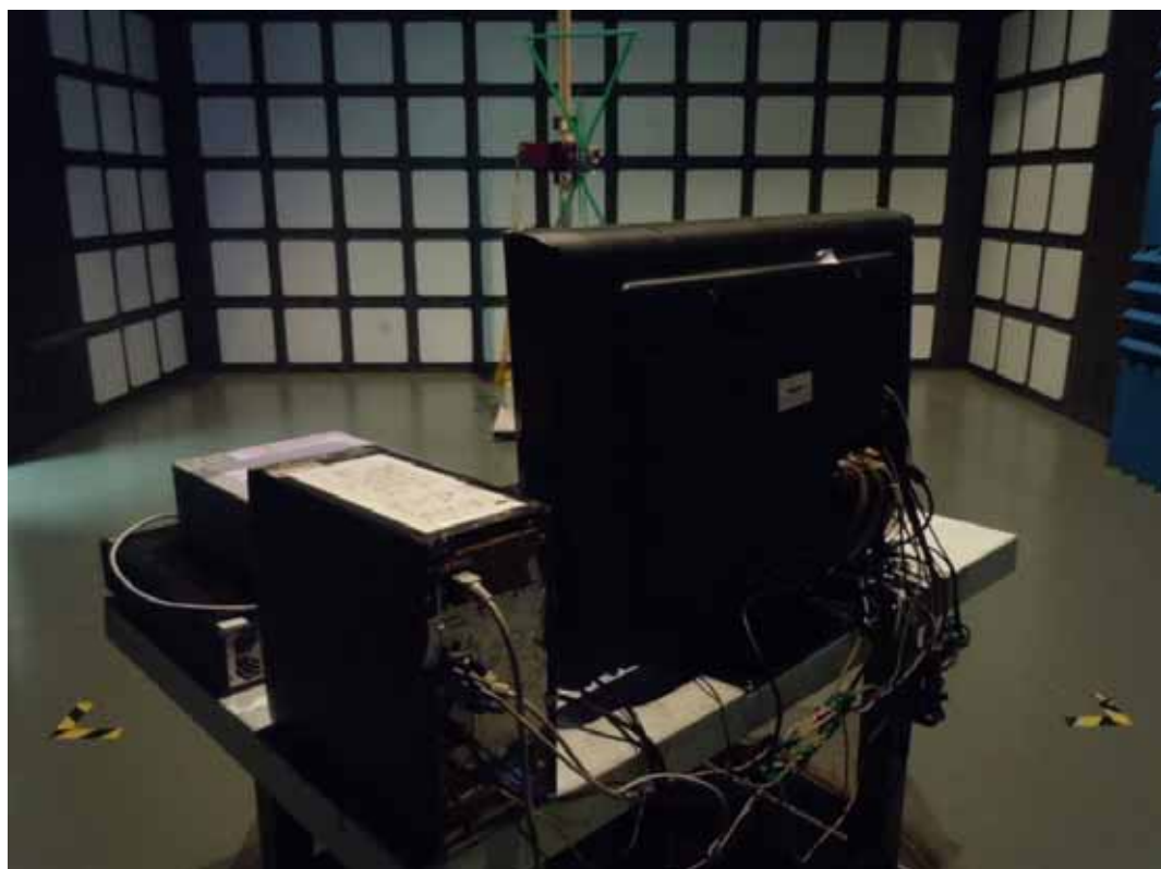
SETUP WITH MAXIMUM DETECTED EMISSION AT VERTICAL POLARIZATION (TEST MODE: D-SUB 1024*768@60Hz)