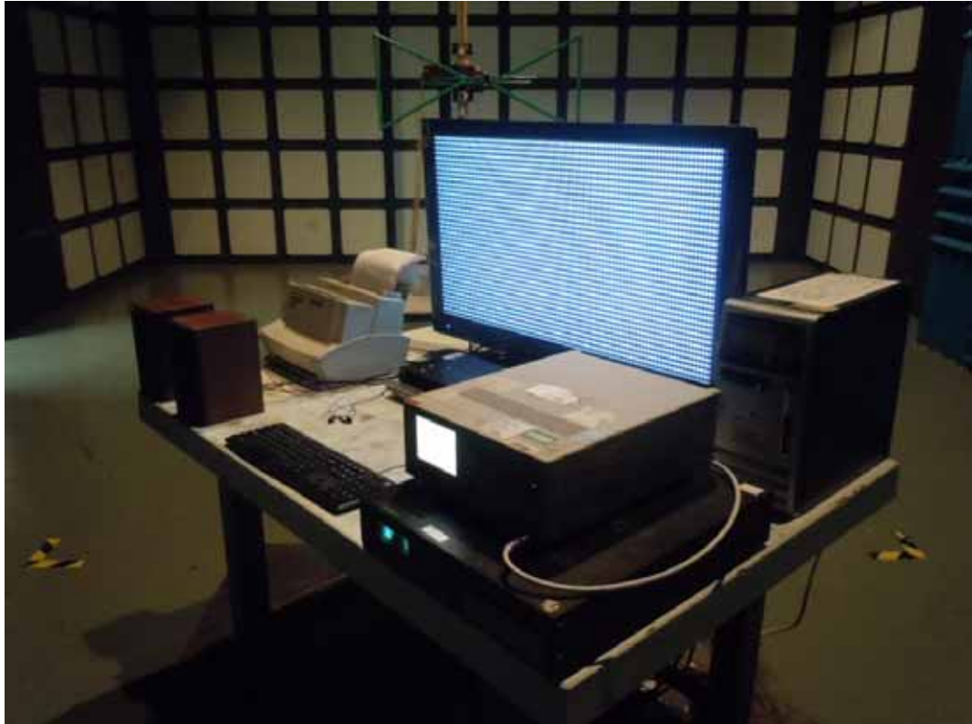
SETUP WITH MAXIMUM DETECTED EMISSION AT HORIZONTAL POLARIZATION (TEST MODE: D-SUB 1024*768@60Hz)