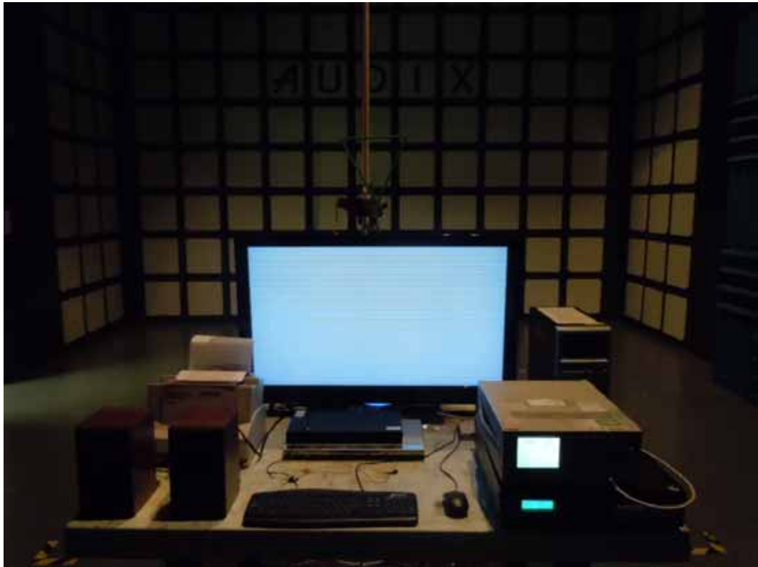
FRONT VIEW OF RADIATED EMISSION TEST