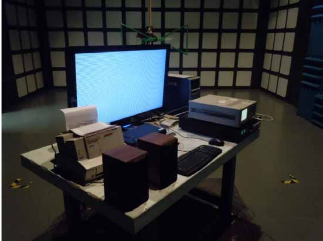
SETUP WITH MAXIMUM DETECTED EMISSION AT HORIZONTAL POLARIZATION (TEST MODE: D-SUB 1024*768@60Hz)