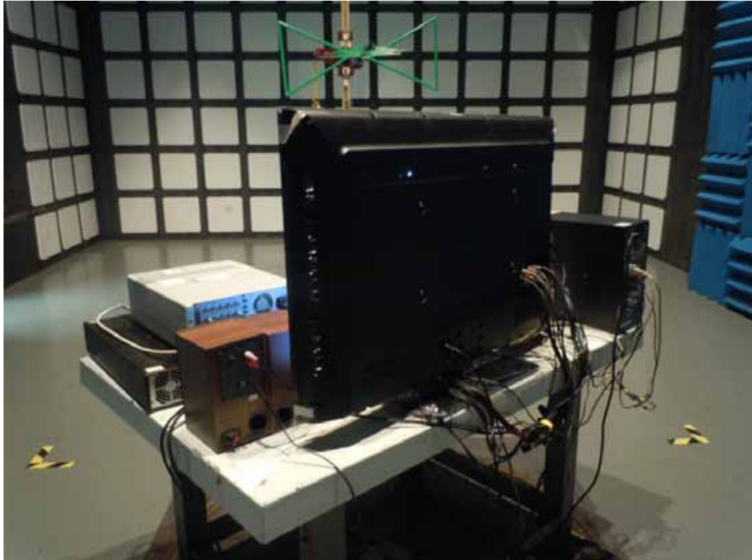
SETUP WITH MAXIMUM DETECTED EMISSION AT HORIZONTAL POLARIZATION (TEST MODE: D-SUB 640*480@60Hz)