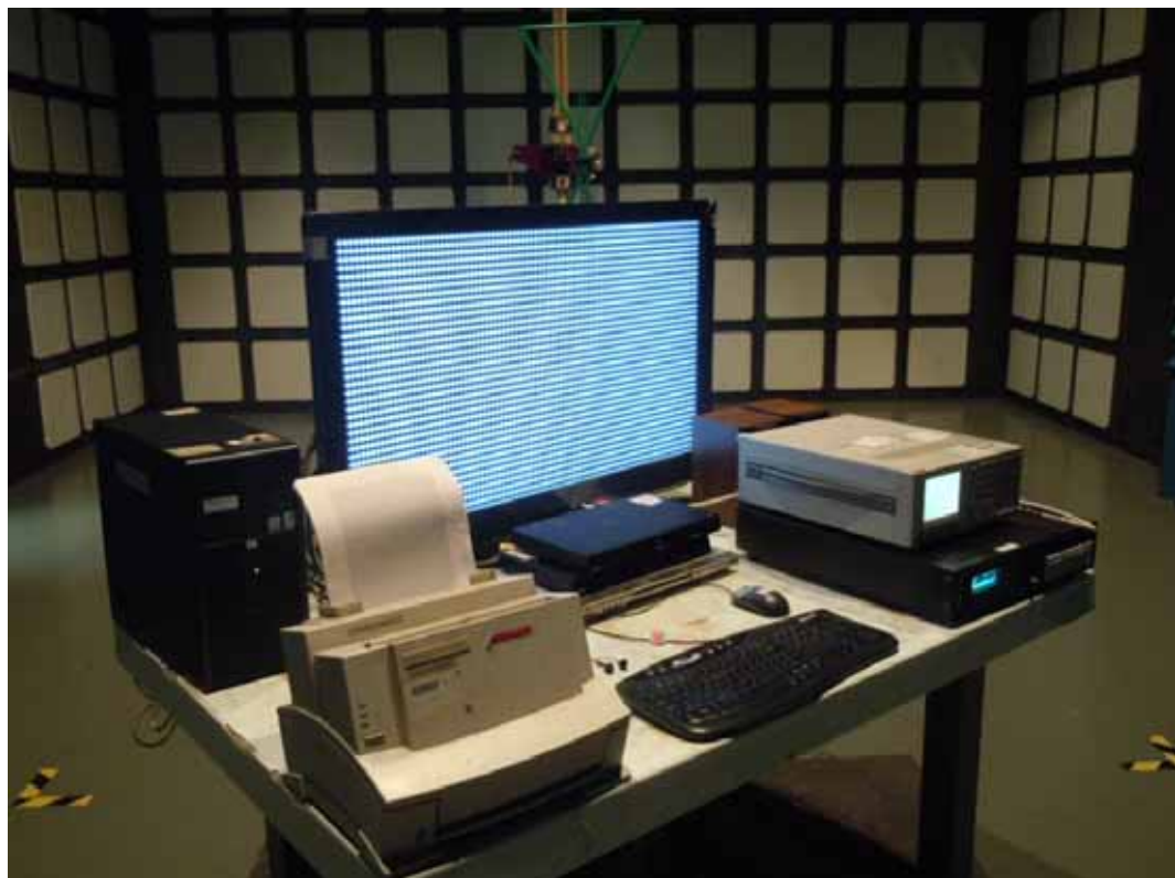
SETUP WITH MAXIMUM DETECTED EMISSION AT VERTICAL POLARIZATION (TEST MODE: D-SUB 640*480@60Hz)