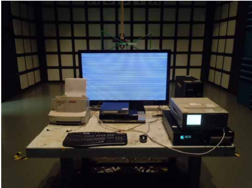
FRONT VIEW OF RADIATED EMISSION TEST