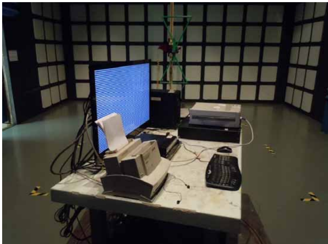
SETUP WITH MAXIMUM DETECTED EMISSION AT VERTICAL POLARIZATION (TEST MODE: D-SUB 800*600@60Hz)