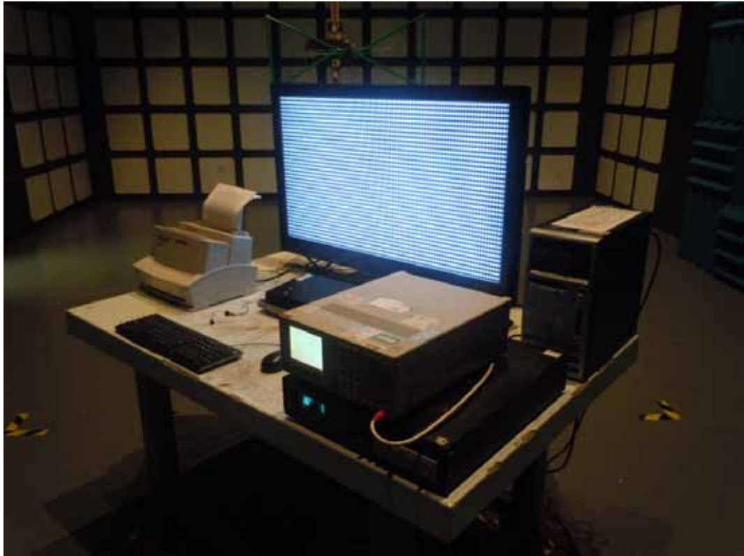
SETUP WITH MAXIMUM DETECTED EMISSION AT HORIZONTAL POLARIZATION (TEST MODE: D-SUB 1024*768@60Hz)