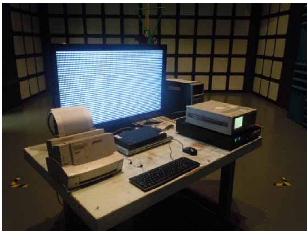
SETUP WITH MAXIMUM DETECTED EMISSION AT VERTICAL POLARIZATION (TEST MODE: D-SUB 1024*768@60Hz)