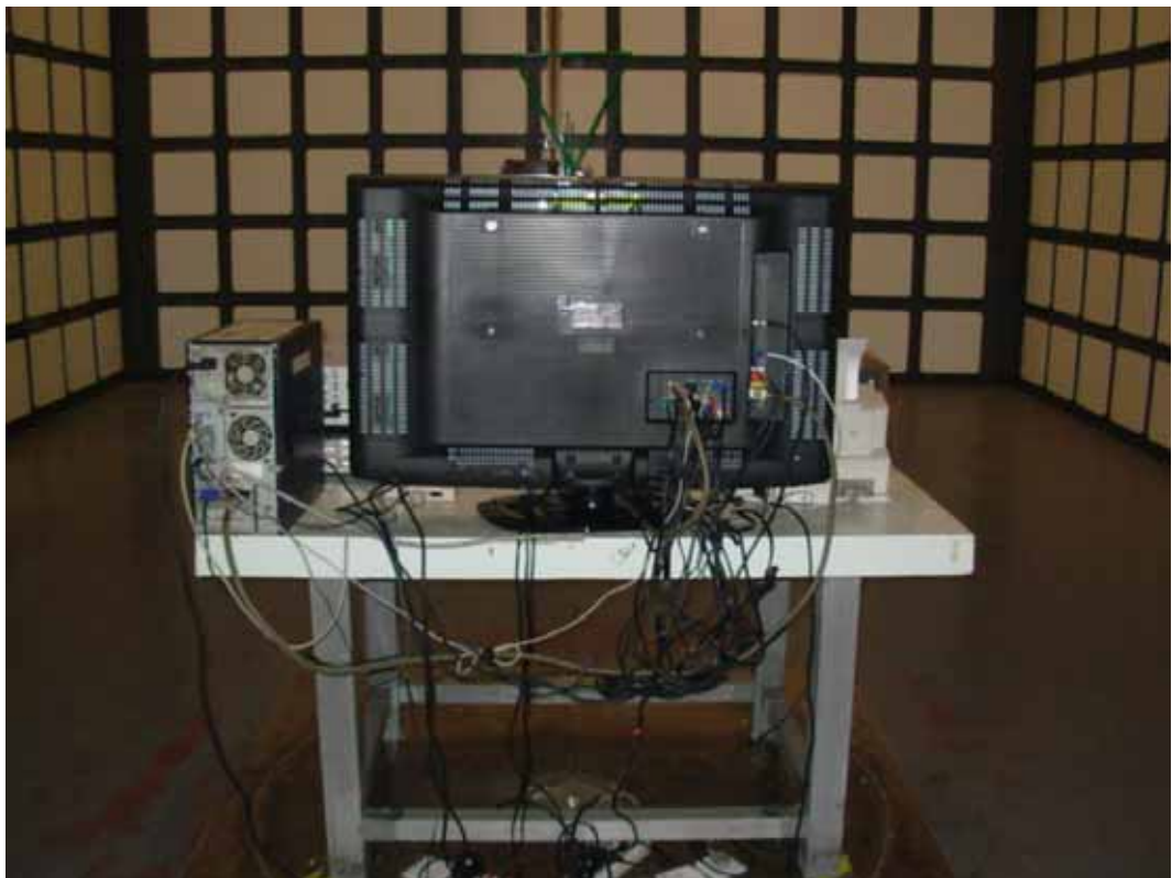
BACK VIEW OF RADIATED EMISSION TEST