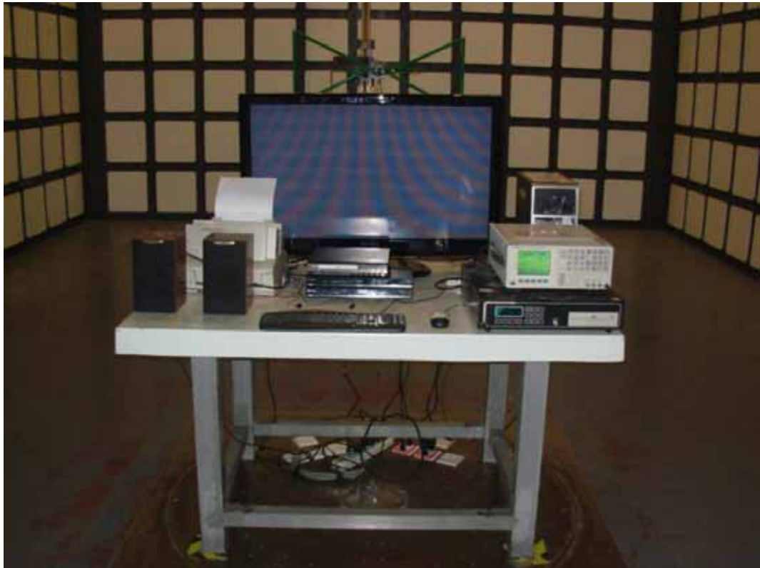
FRONT VIEW OF RADIATED EMISSION TEST