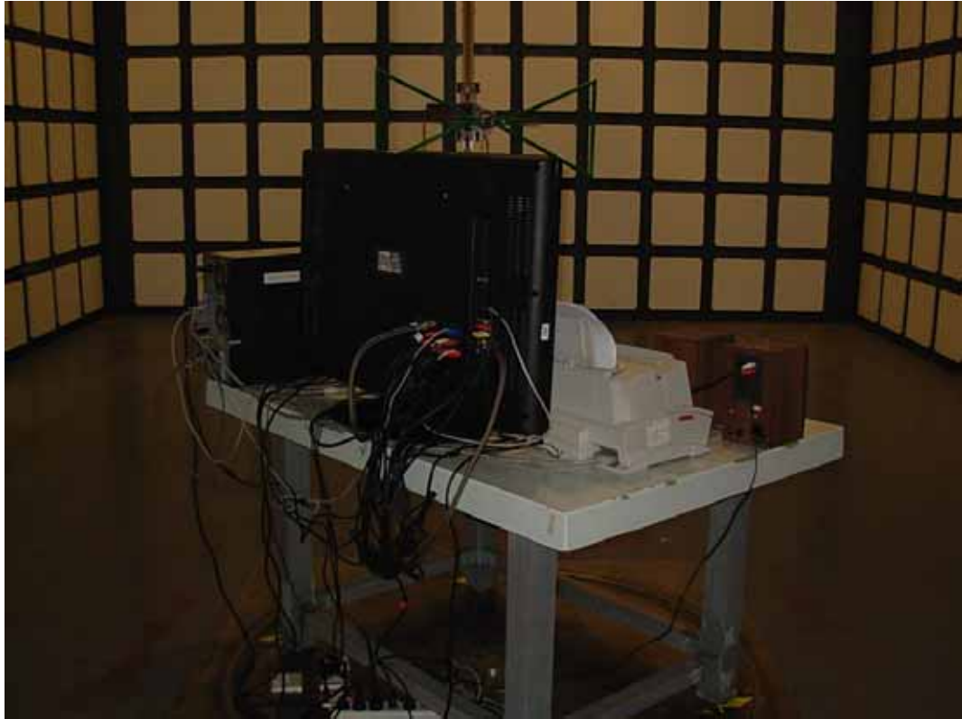
SETUP WITH MAXIMUM DETECTED EMISSION AT HORIZONTAL POLARIZATION (HDMI 1024*768@60Hz)