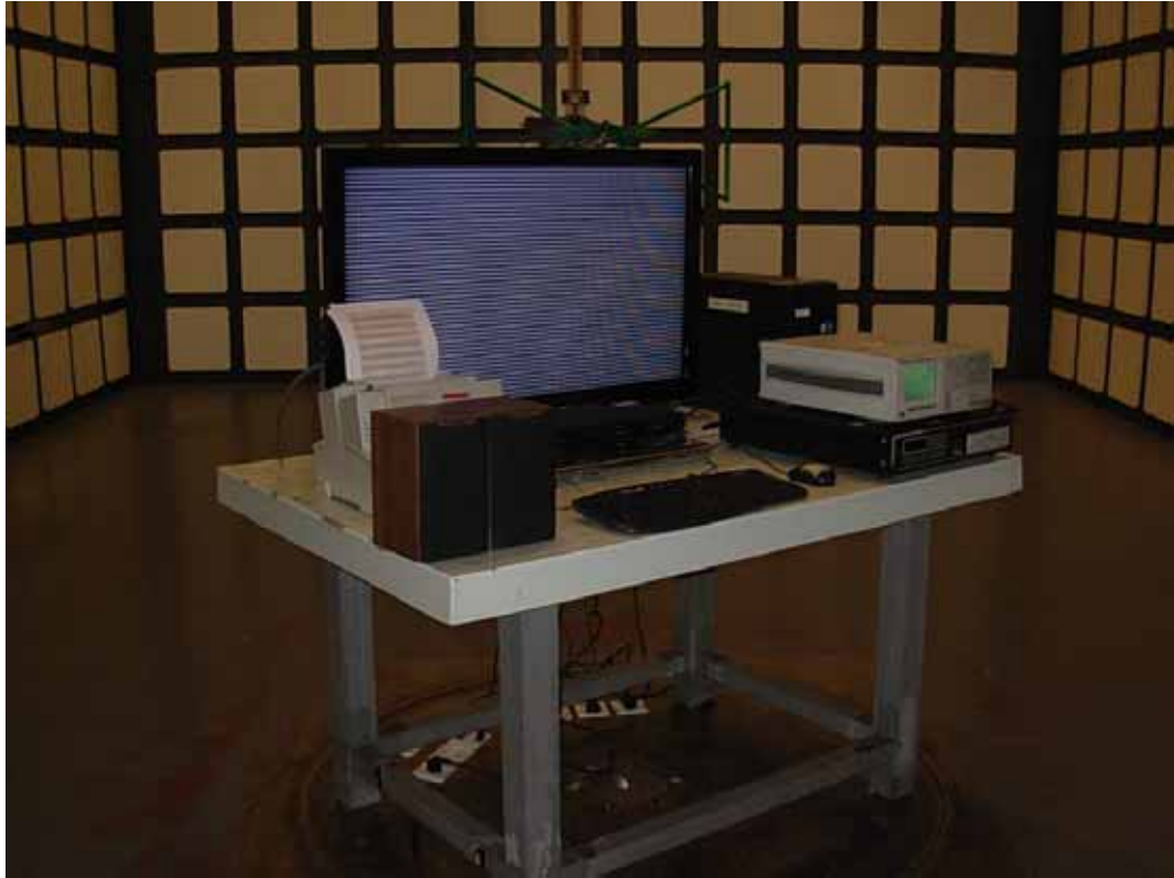
SETUP WITH MAXIMUM DETECTED EMISSION AT HORIZONTAL POLARIZATION (D-SUB 1024*768@60Hz)