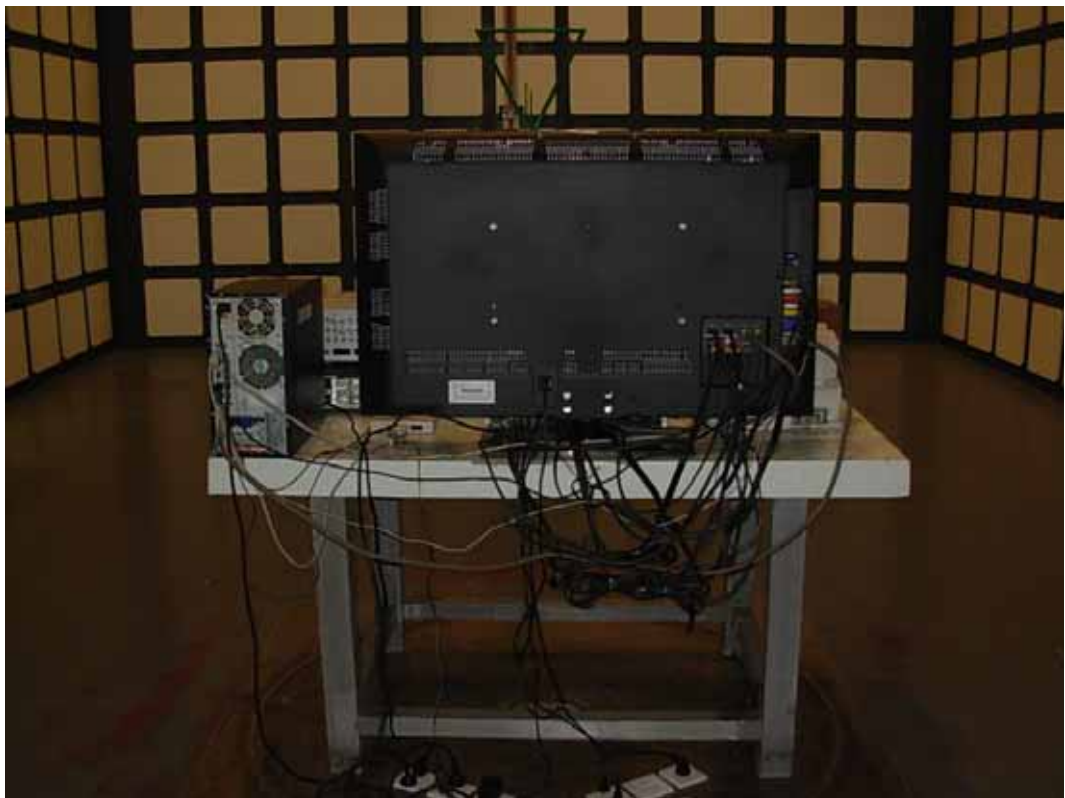
BACK VIEW OF RADIATED EMISSION TEST