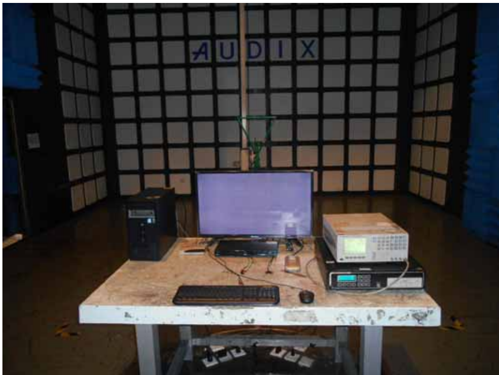
FRONT VIEW OF RADIATED EMISSION TEST (BELOW 1GHZ)