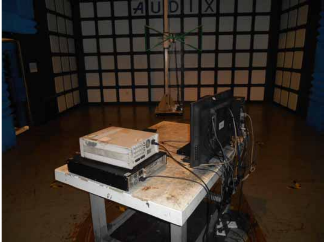
SETUP WITH MAXIMUM DETECTED EMISSION AT HORIZONTAL POLARIZATION (TEST MODE: HDMI 1024*768@60HZ & 1KHZ PLAYING)