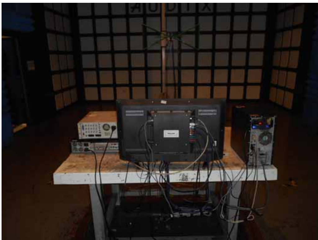
BACK VIEW OF RADIATED EMISSION TEST (BELOW 1GHZ)