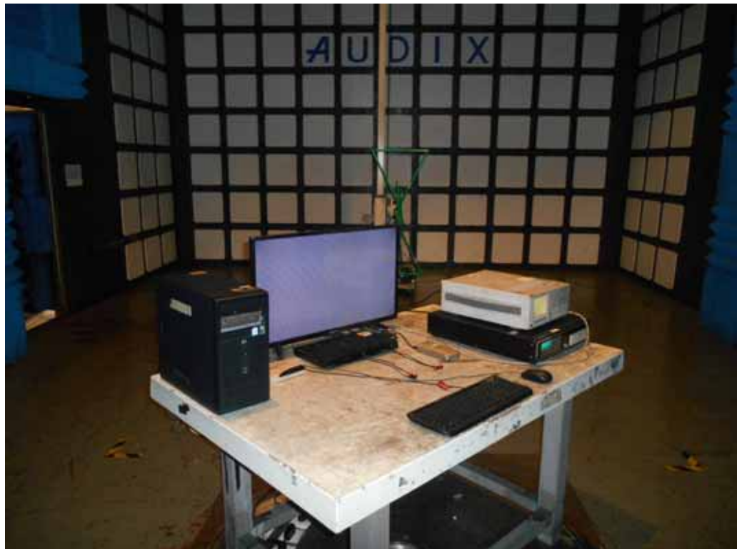
SETUP WITH MAXIMUM DETECTED EMISSION AT VERTICAL POLARIZATION (TEST MODE: HDMI 1024*768@60HZ & 1KHZ PLAYING)