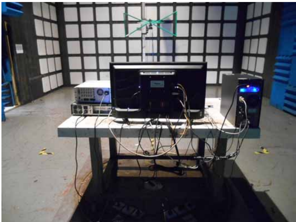
BACK VIEW OF RADIATED EMISSION TEST (BELOW 1GHZ)