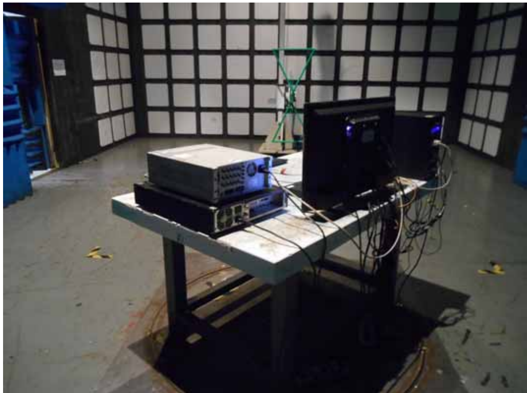
SETUP WITH MAXIMUM DETECTED EMISSION AT VERTICAL POLARIZATION (TEST MODE: HDMI 1920*1080@60HZ & 1KHZ PLAYING)