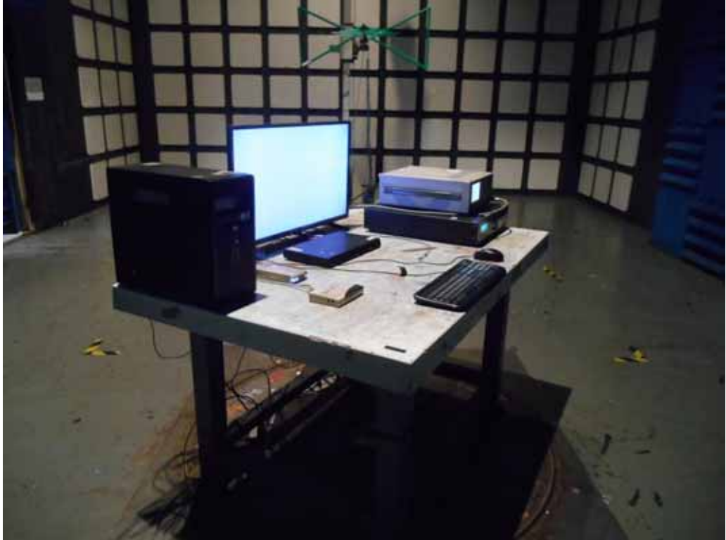
SETUP WITH MAXIMUM DETECTED EMISSION AT HORIZONTAL POLARIZATION (TEST MODE: HDMI 1920*1080@60HZ & 1KHZ PLAYING)