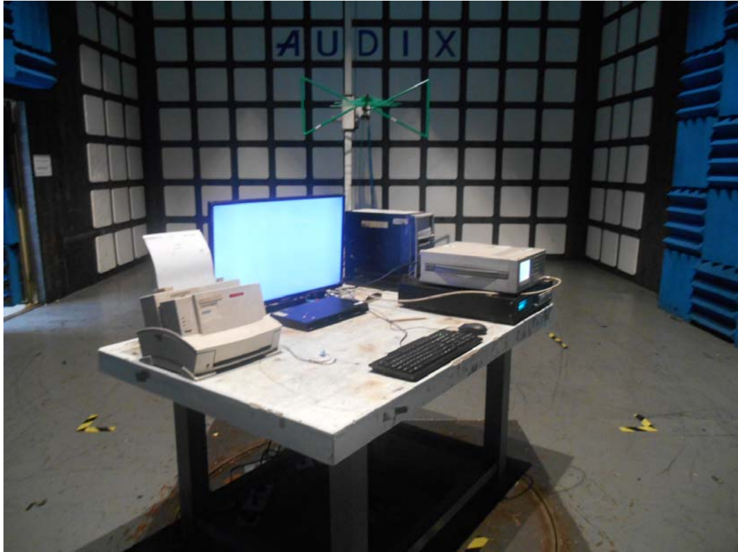
SETUP WITH MAXIMUM DETECTED EMISSION AT HORIZONTAL POLARIZATION (TEST MODE: HDMI 1280*1024@60HZ & 1KHZ PLAYING)