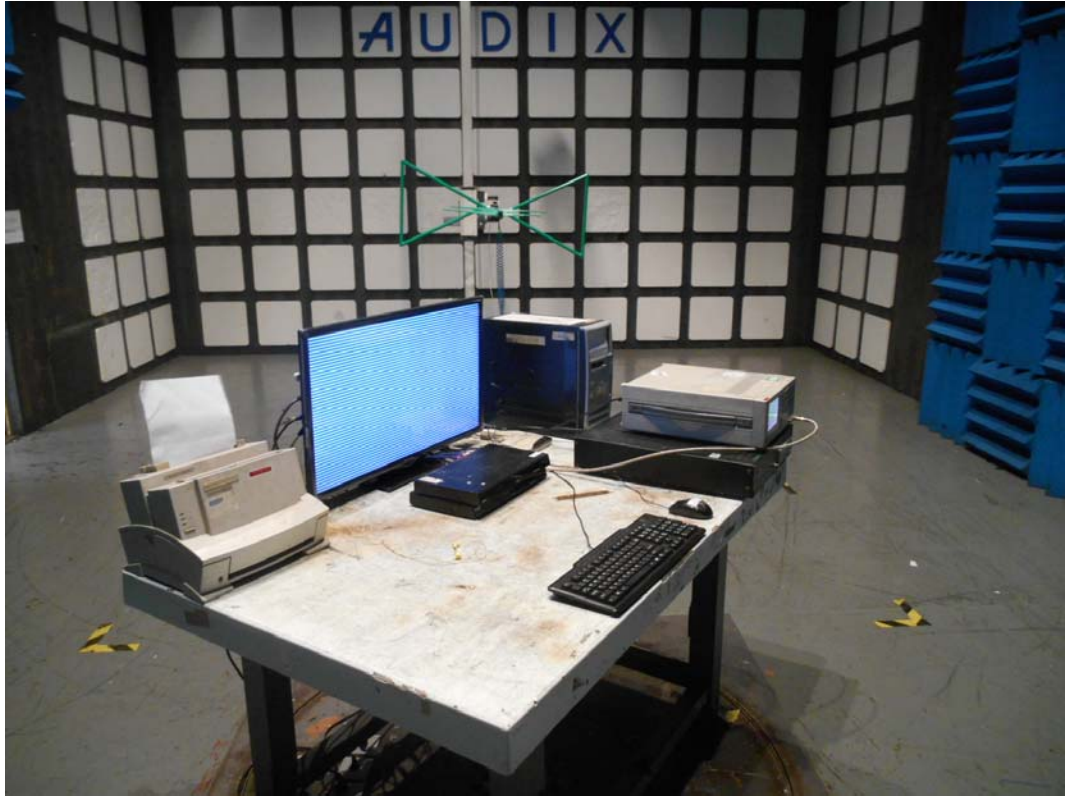
SETUP WITH MAXIMUM DETECTED EMISSION AT HORIZONTAL POLARIZATION (TEST MODE: HDMI 1024*768@60Hz & 1kHz PLAYING)