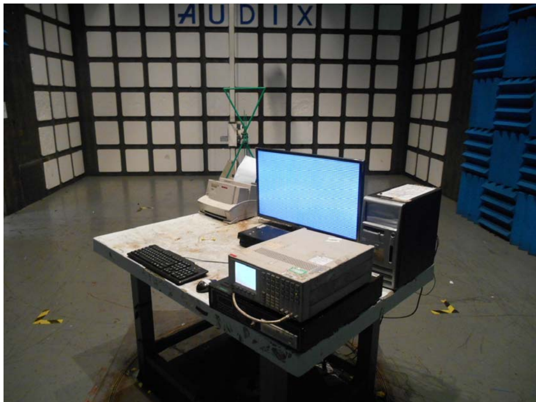
SETUP WITH MAXIMUM DETECTED EMISSION AT VERTICAL POLARIZATION (TEST MODE: HDMI 1024*768@60Hz & 1kHz PLAYING)