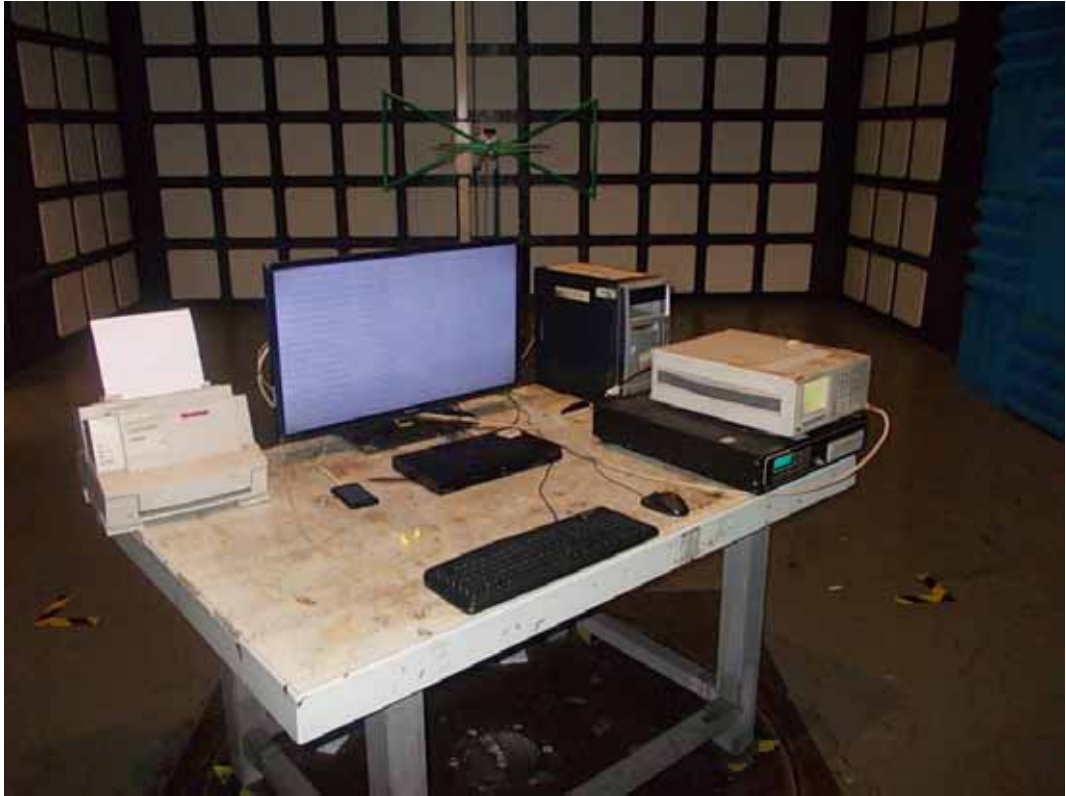
SETUP WITH MAXIMUM DETECTED EMISSION AT HORIZONTAL POLARIZATION (TEST MODE: HDMI 640*480@60Hz)