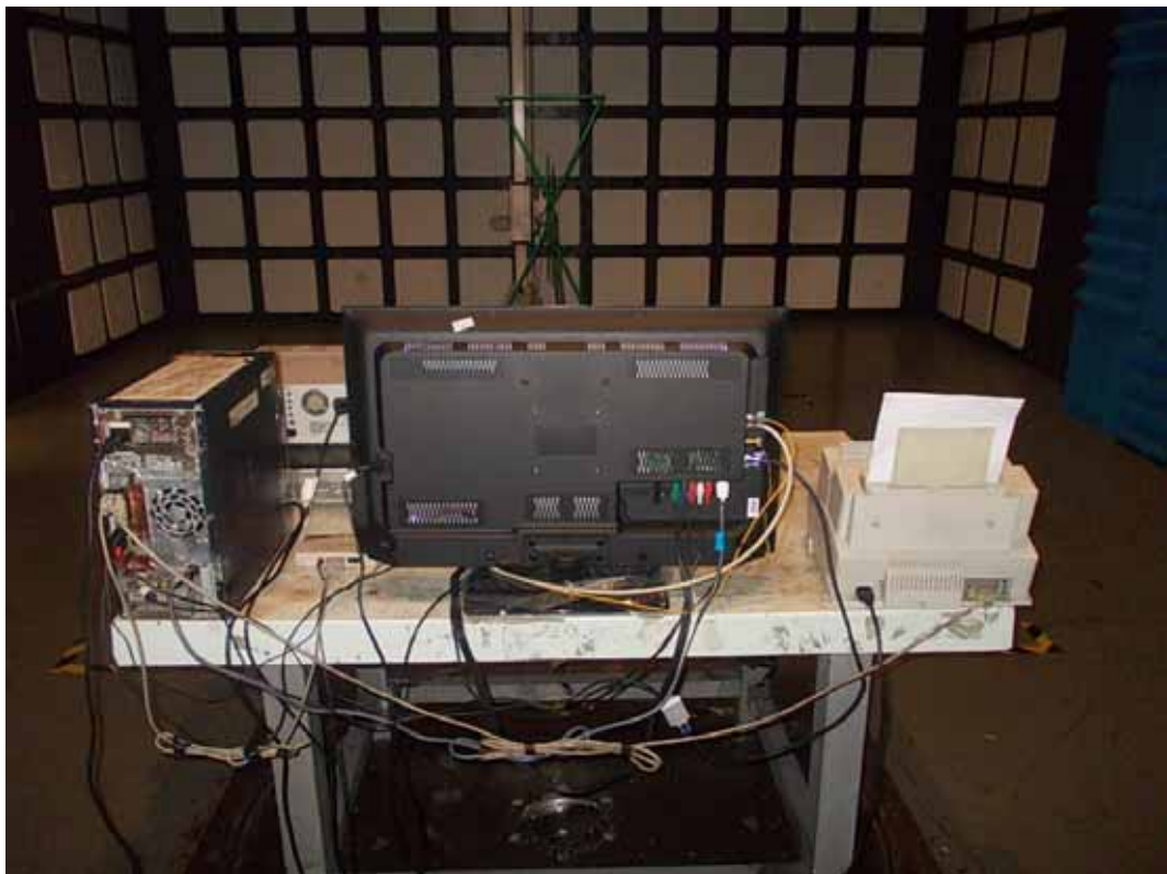
BACK VIEW OF RADIATED EMISSION TEST