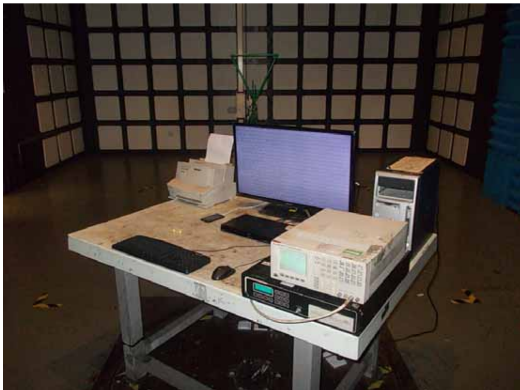
SETUP WITH MAXIMUM DETECTED EMISSION AT VERTICAL POLARIZATION (TEST MODE: HDMI 640*480@60Hz)