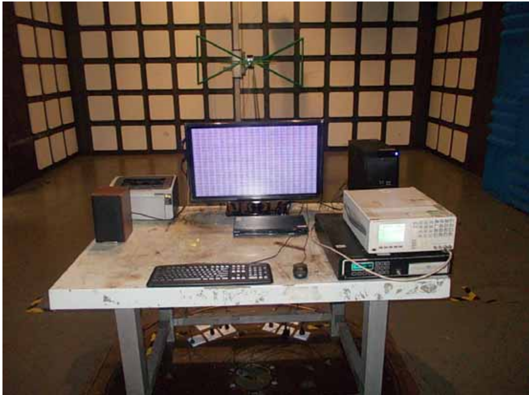
FRONT VIEW OF RADIATED EMISSION TEST