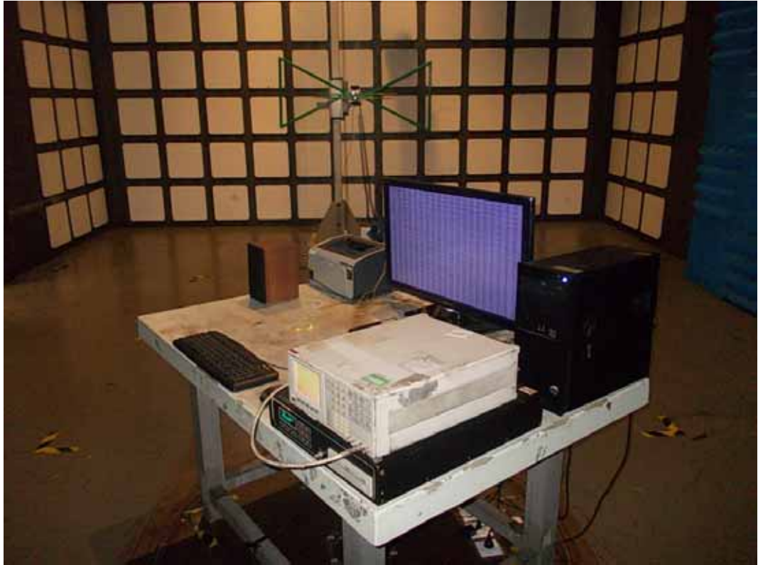
SETUP WITH MAXIMUM DETECTED EMISSION AT HORIZONTAL POLARIZATION (TEST MODE: HDMI 1920*1080@60Hz)