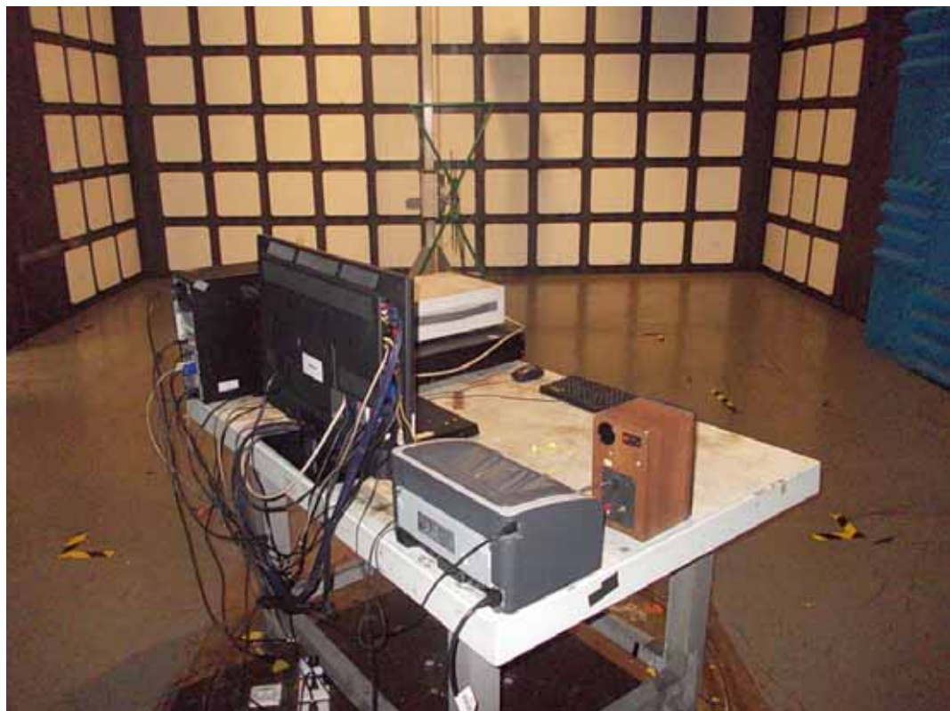
SETUP WITH MAXIMUM DETECTED EMISSION AT VERTICAL POLARIZATION (TEST MODE: HDMI 1920*1080@60Hz)