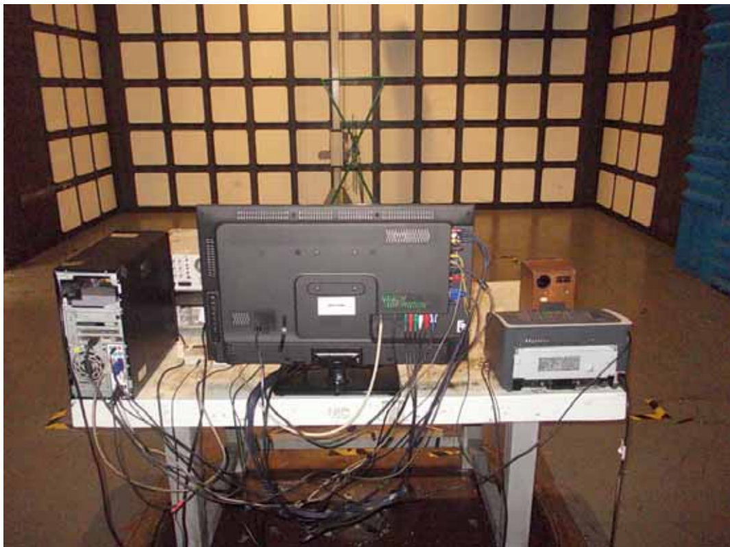
BACK VIEW OF RADIATED EMISSION TEST