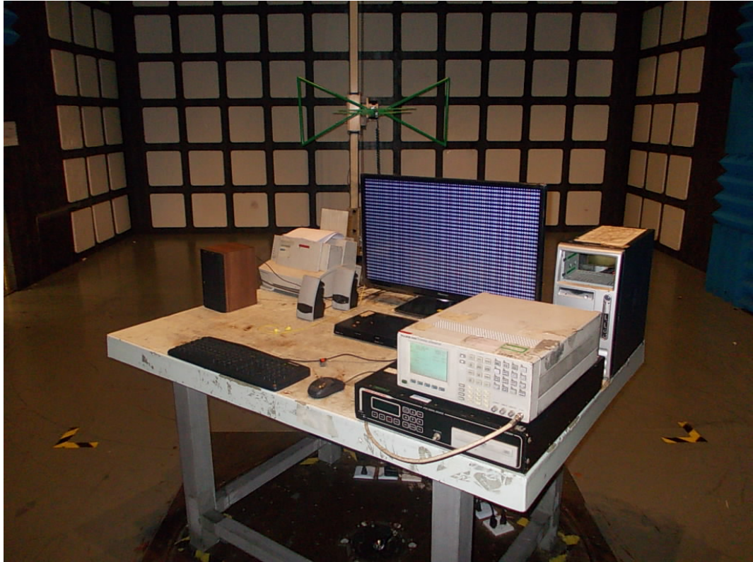
SETUP WITH MAXIMUM DETECTED EMISSION AT HORIZONTAL POLARIZATION (TEST MODE: HDMI 1920*1080@60Hz)