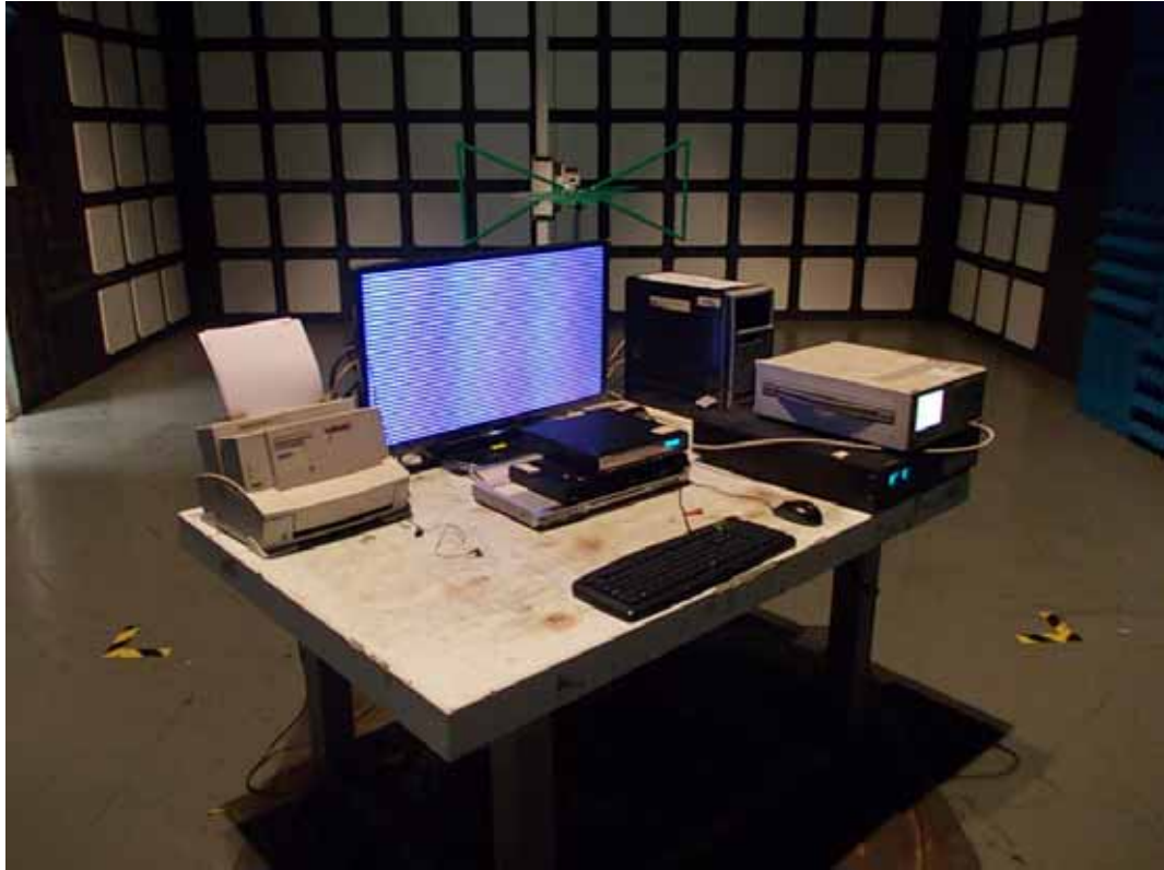
SETUP WITH MAXIMUM DETECTED EMISSION AT HORIZONTAL POLARIZATION (TEST MODE: D-SUB 1024*768@60Hz)