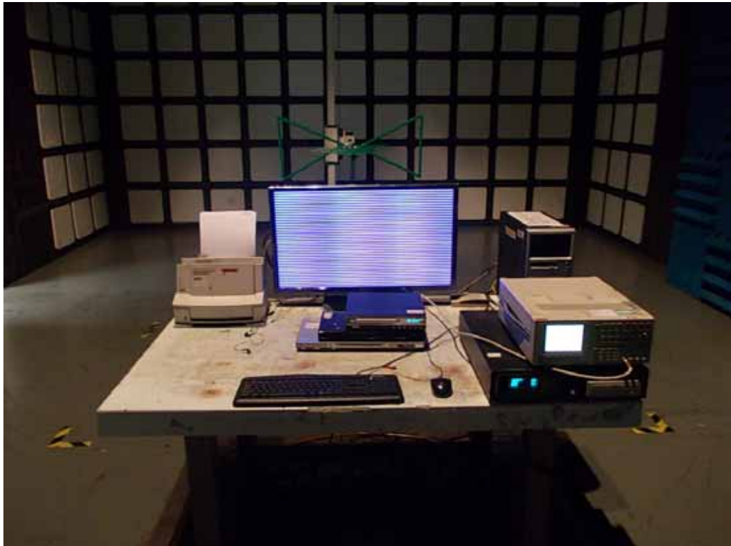
FRONT VIEW OF RADIATED EMISSION TEST