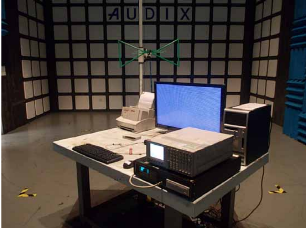
SETUP WITH MAXIMUM DETECTED EMISSION AT HORIZONTAL POLARIZATION (TEST MODE: D-SUB 640*480@60Hz)