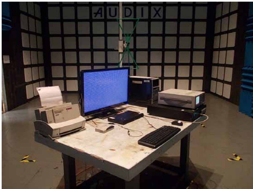
SETUP WITH MAXIMUM DETECTED EMISSION AT VERTICAL POLARIZATION (TEST MODE: D-SUB 640*480@60Hz)