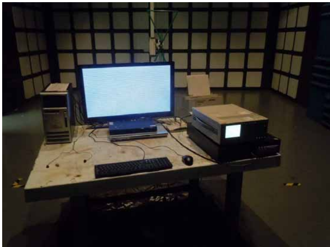
SETUP WITH MAXIMUM DETECTED EMISSION AT VERTICAL POLARIZATION (TEST MODE: D-SUB 1024*768@60Hz)