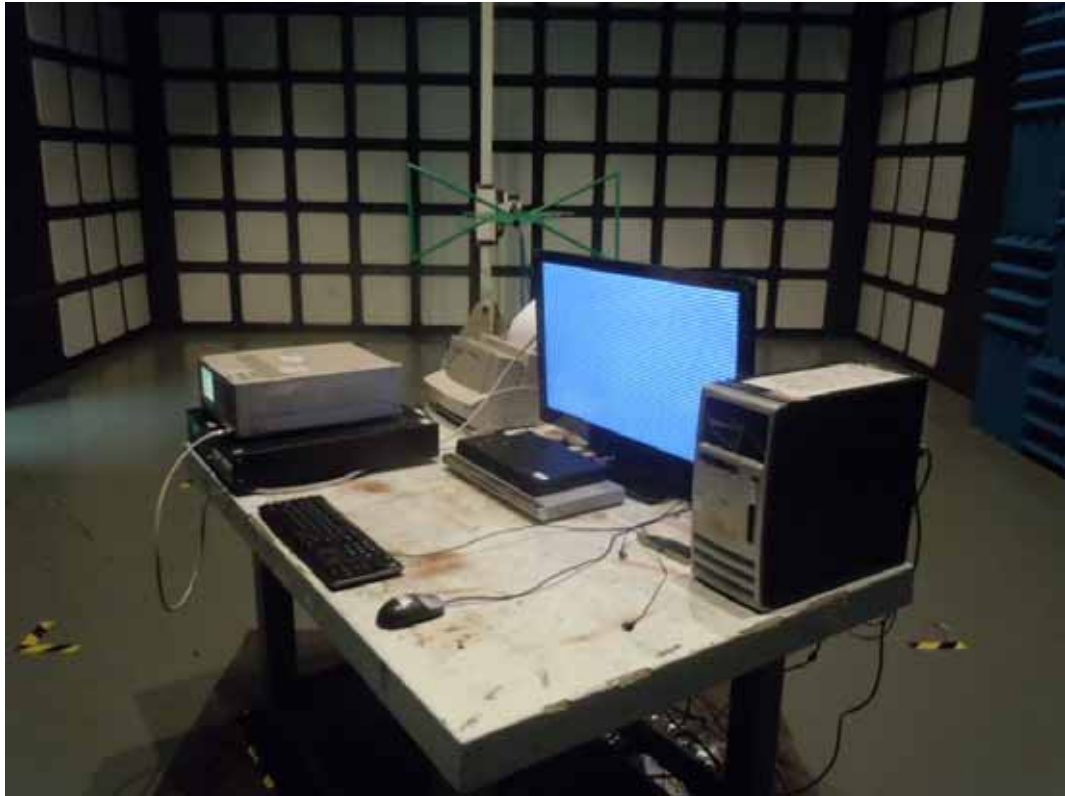
SETUP WITH MAXIMUM DETECTED EMISSION AT HORIZONTAL POLARIZATION (TEST MODE: D-SUB 1024*768@60Hz)