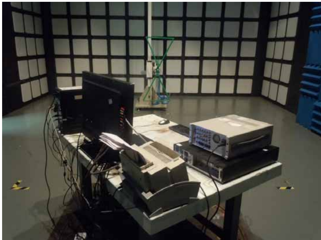
SETUP WITH MAXIMUM DETECTED EMISSION AT VERTICAL POLARIZATION (TEST MODE: D-SUB 1024*768@60Hz)