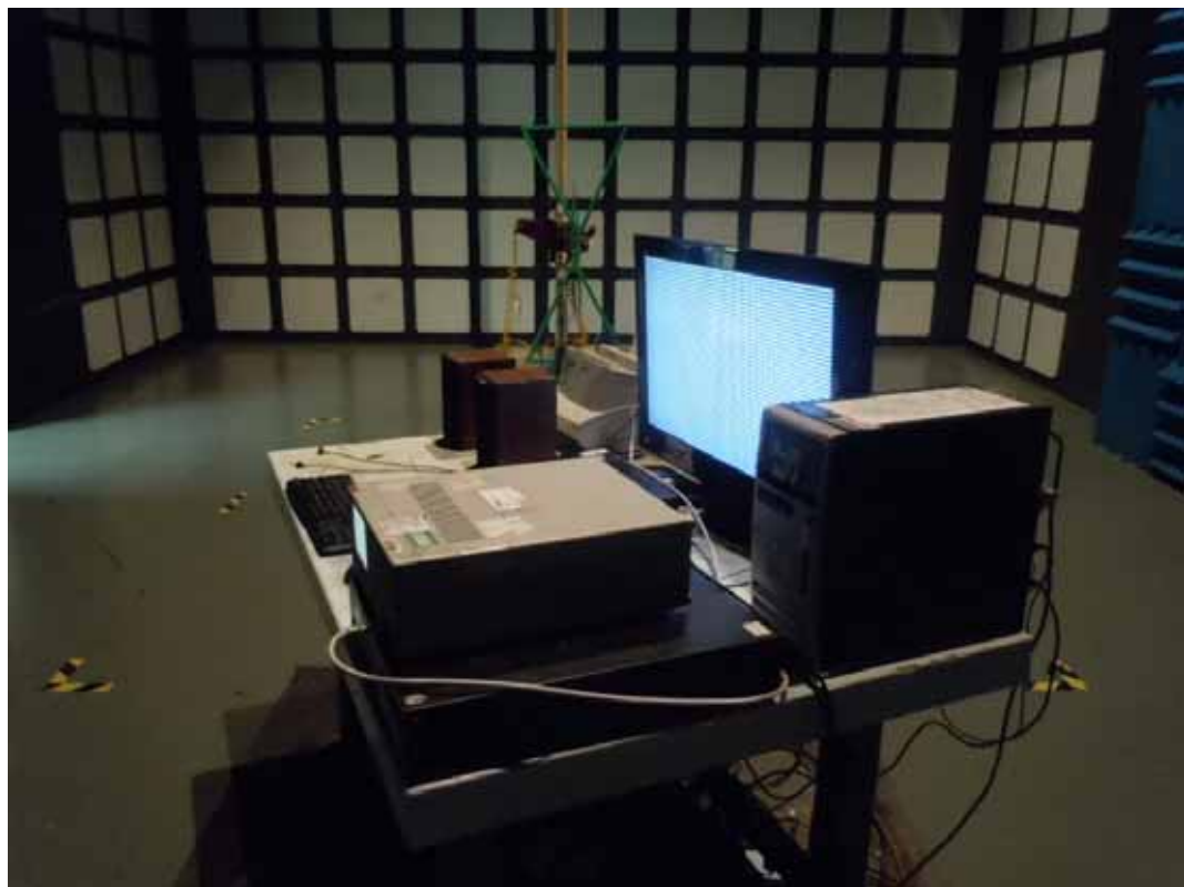
SETUP WITH MAXIMUM DETECTED EMISSION AT VERTICAL POLARIZATION (TEST MODE: D-SUB 1024*768@60Hz)