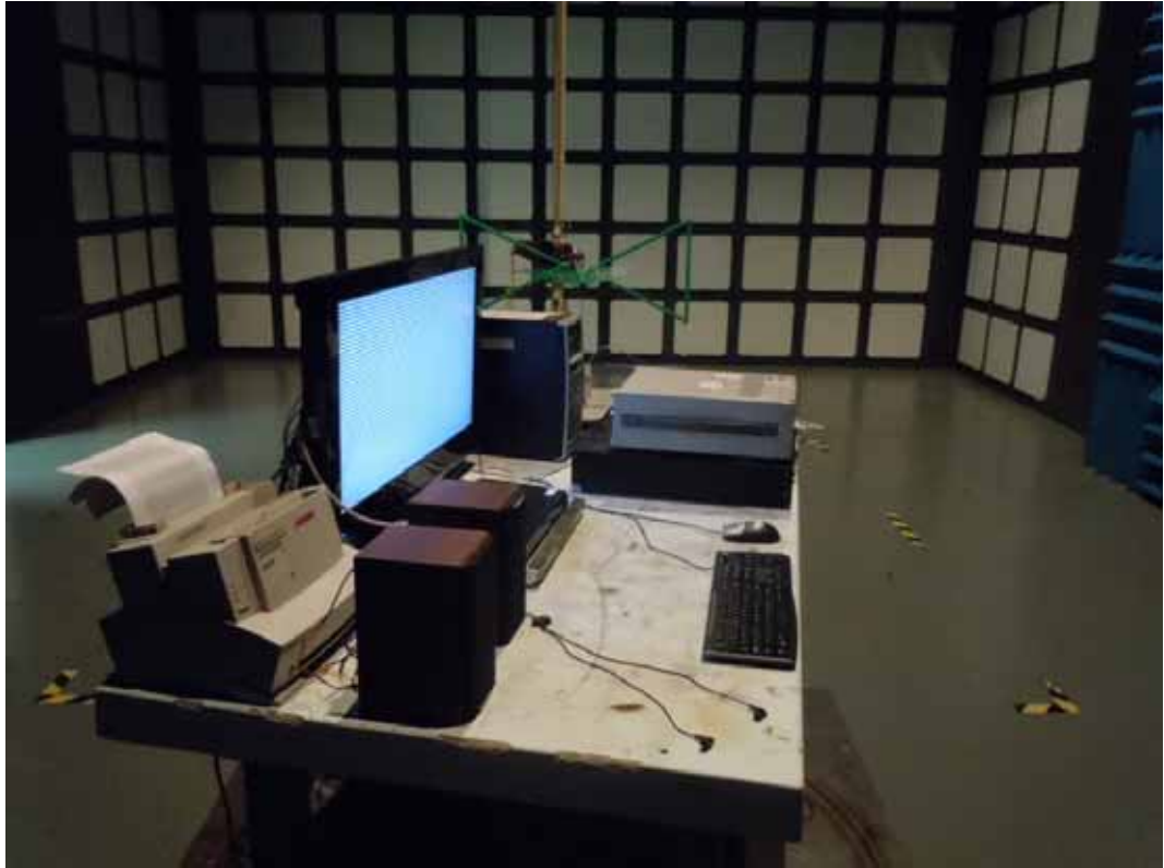
SETUP WITH MAXIMUM DETECTED EMISSION AT HORIZONTAL POLARIZATION (TEST MODE: D-SUB 1024*768@60Hz)