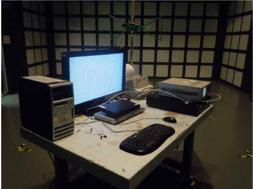
SETUP WITH MAXIMUM DETECTED EMISSION AT HORIZONTAL POLARIZATION (TEST MODE: D-SUB 640*480@60Hz)