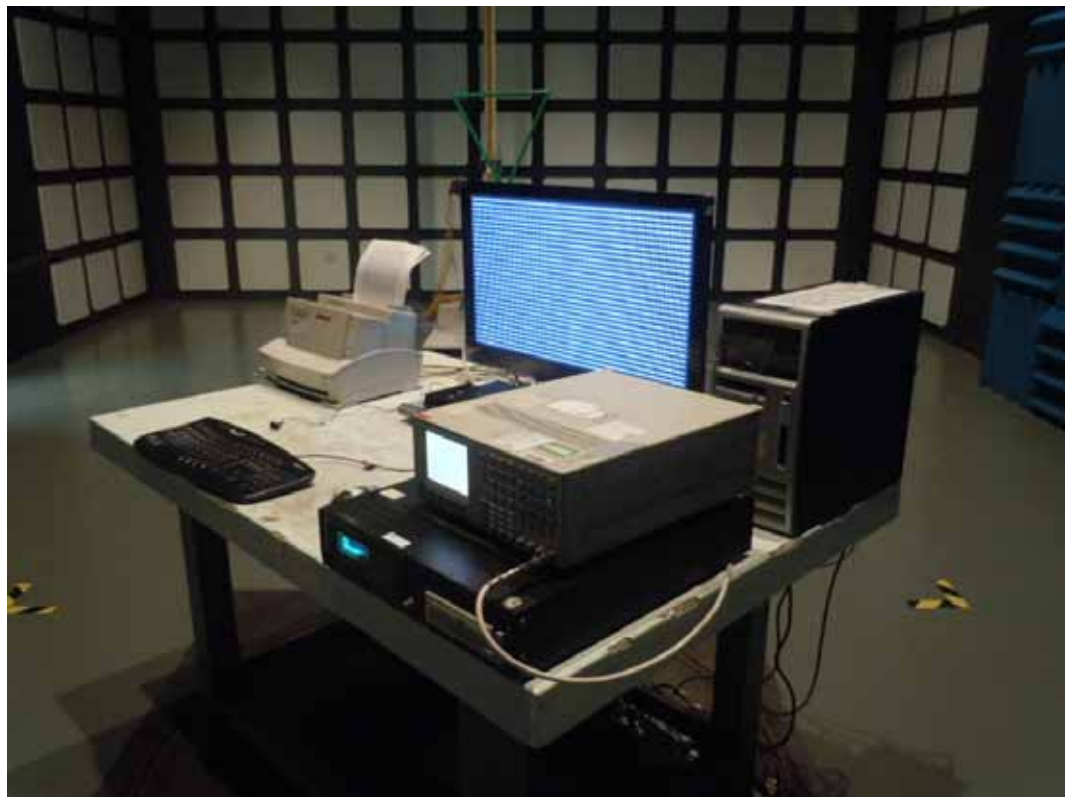
SETUP WITH MAXIMUM DETECTED EMISSION AT VERTICAL POLARIZATION (TEST MODE: D-SUB 800*600@60Hz)