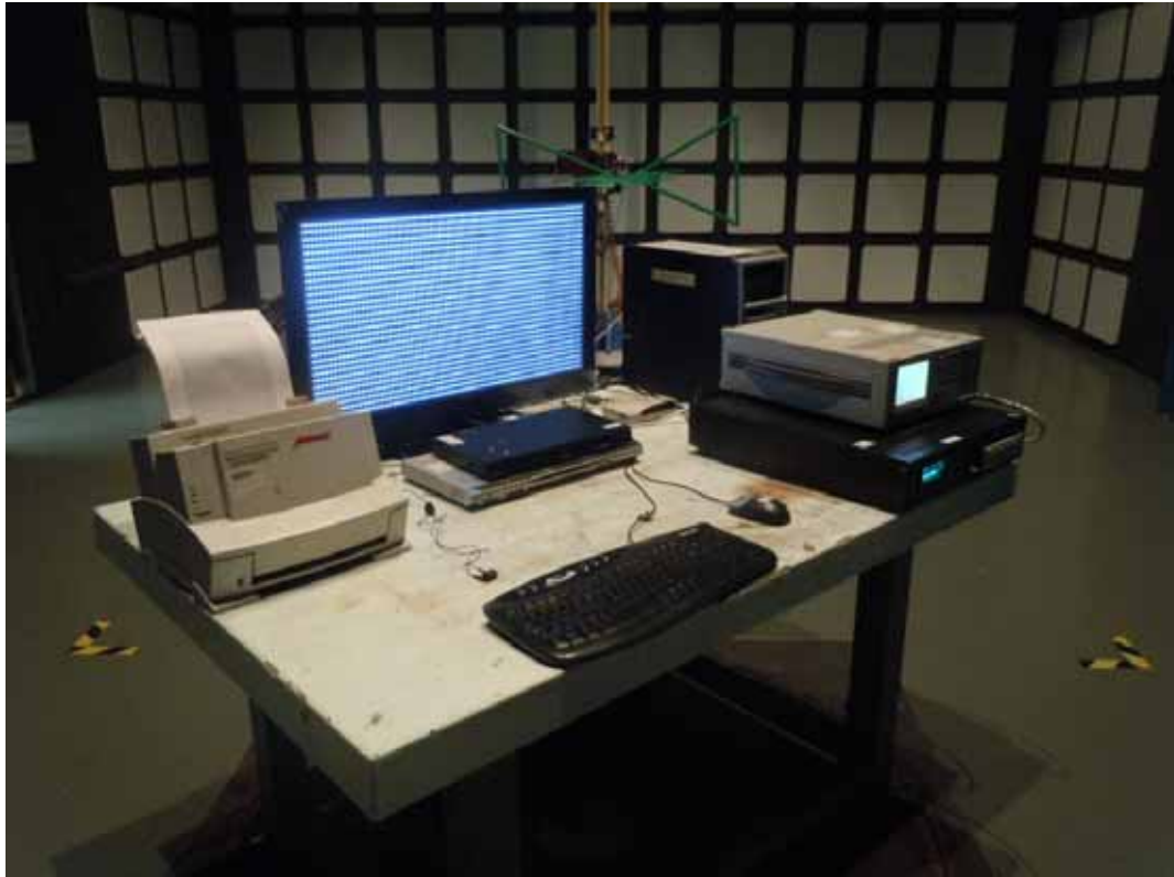
SETUP WITH MAXIMUM DETECTED EMISSION AT HORIZONTAL POLARIZATION (TEST MODE: D-SUB 800*600@60Hz)