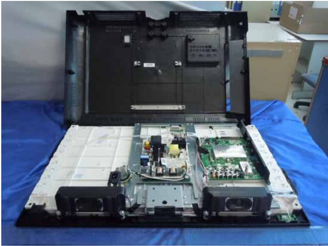
FIGURE 1 LCD TV (M/N: LHD32V77MH) COVER REMOVED