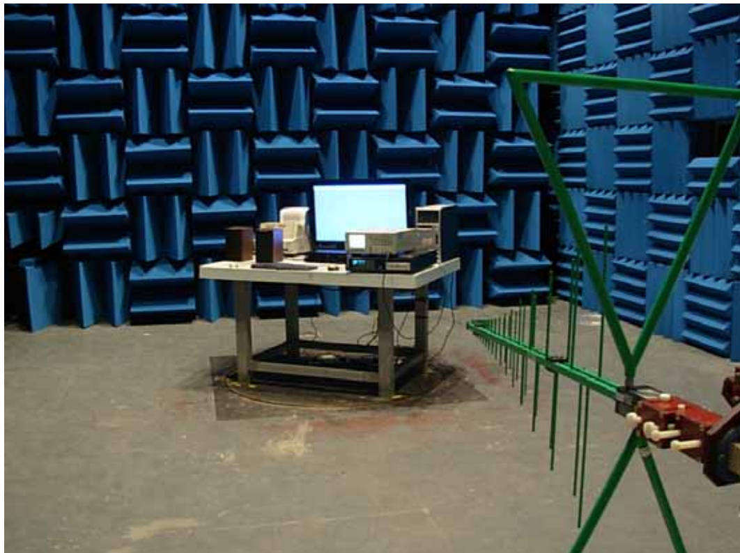
SETUP WITH MAXIMUM DETECTED EMISSION AT VERTICAL POLARIZATION (HDMI 1024*768@60Hz)