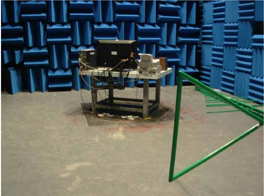
SETUP WITH MAXIMUM DETECTED EMISSION AT HORIZONTAL POLARIZATION (HDMI 1024*768@60Hz)