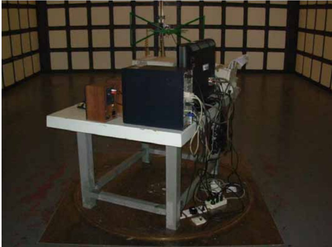
SETUP WITH MAXIMUM DETECTED EMISSION AT HORIZONTAL POLARIZATION (HDMI 1024*768@60Hz)