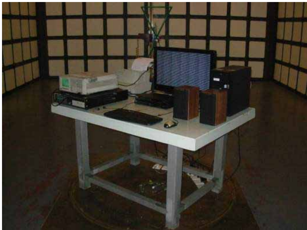
SETUP WITH MAXIMUM DETECTED EMISSION AT VERTICAL POLARIZATION (HDMI 1024*768@60Hz)