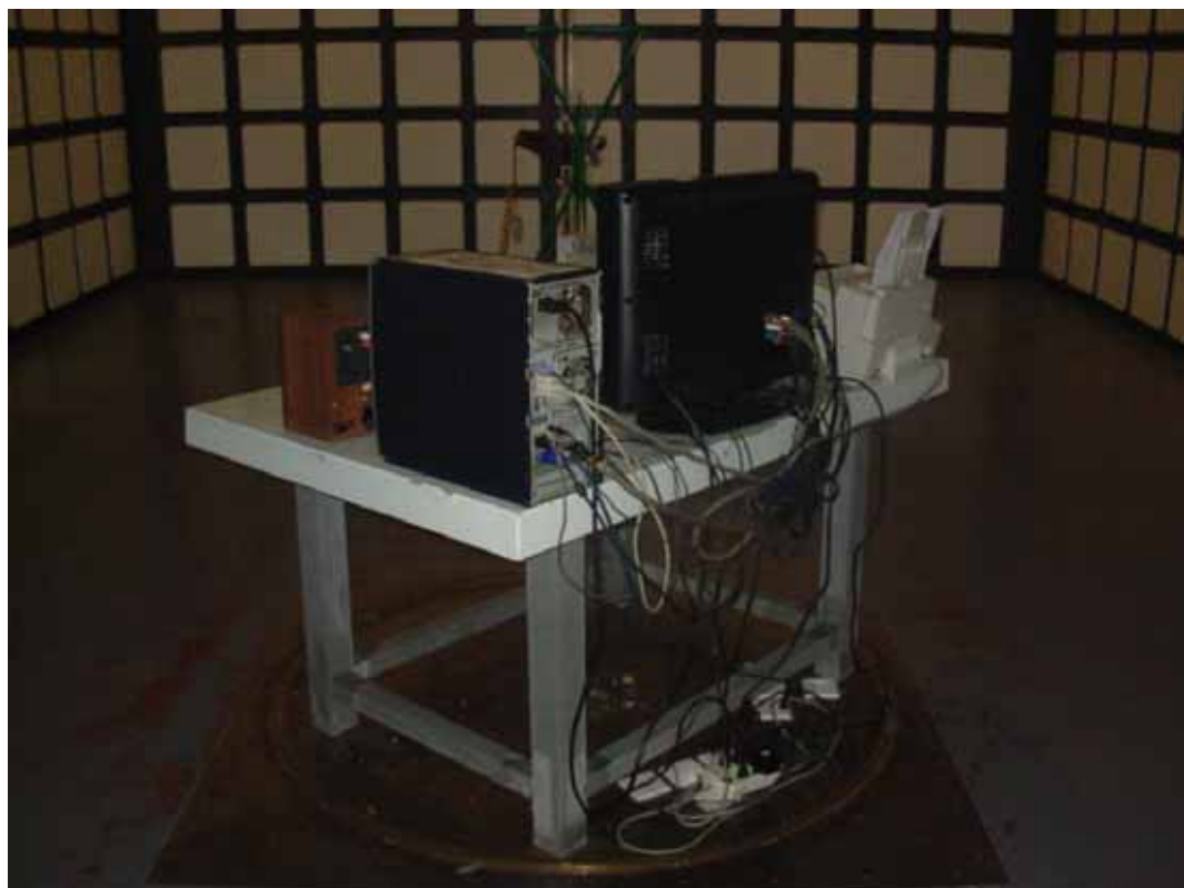
SETUP WITH MAXIMUM DETECTED EMISSION AT VERTICAL POLARIZATION (HDMI 1360*768@60Hz)