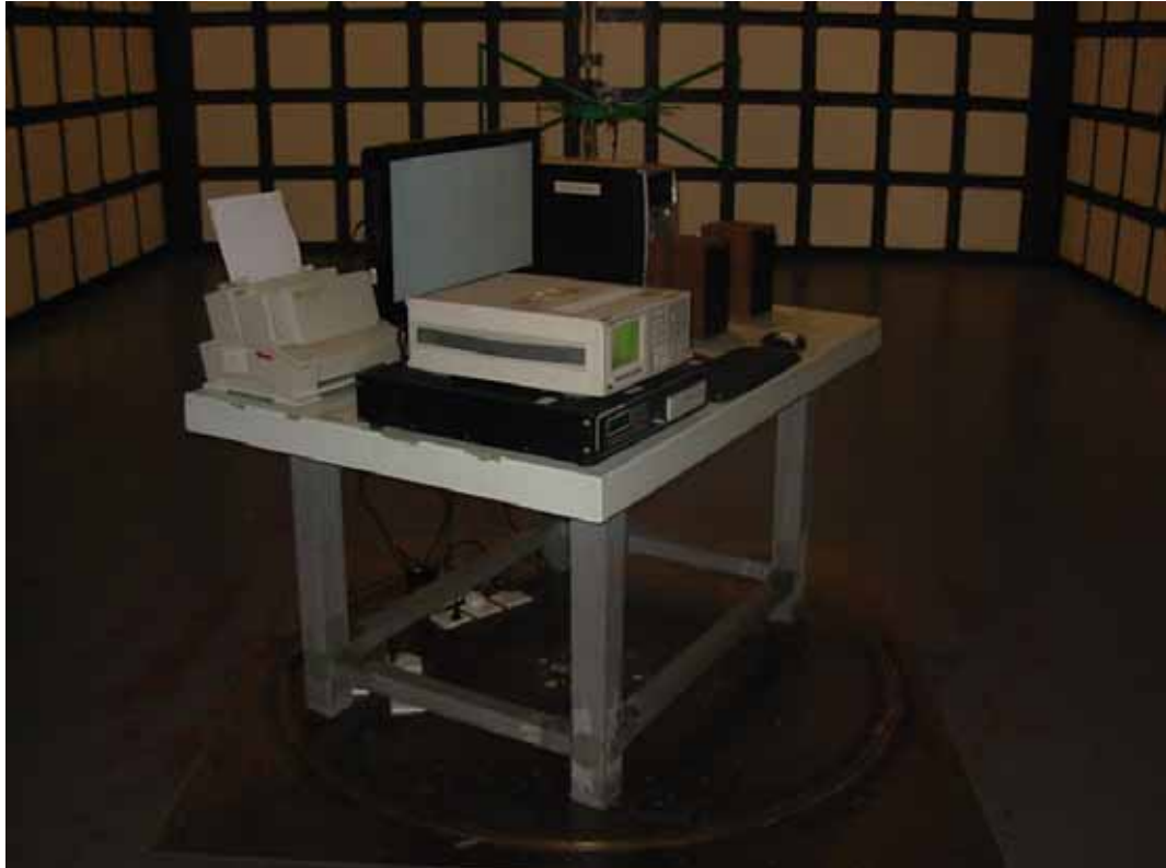
SETUP WITH MAXIMUM DETECTED EMISSION AT HORIZONTAL POLARIZATION (HDMI 1360*768@60Hz)