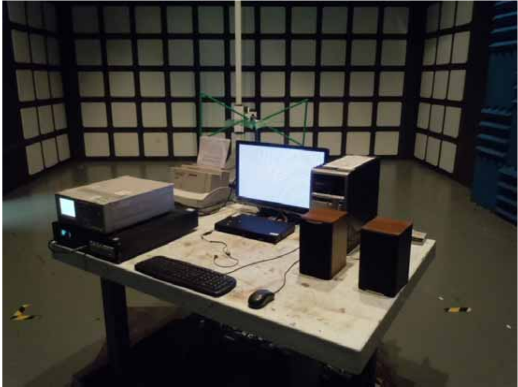
SETUP WITH MAXIMUM DETECTED EMISSION AT HORIZONTAL POLARIZATION (TEST MODE: D-SUB 1024*768@60Hz)