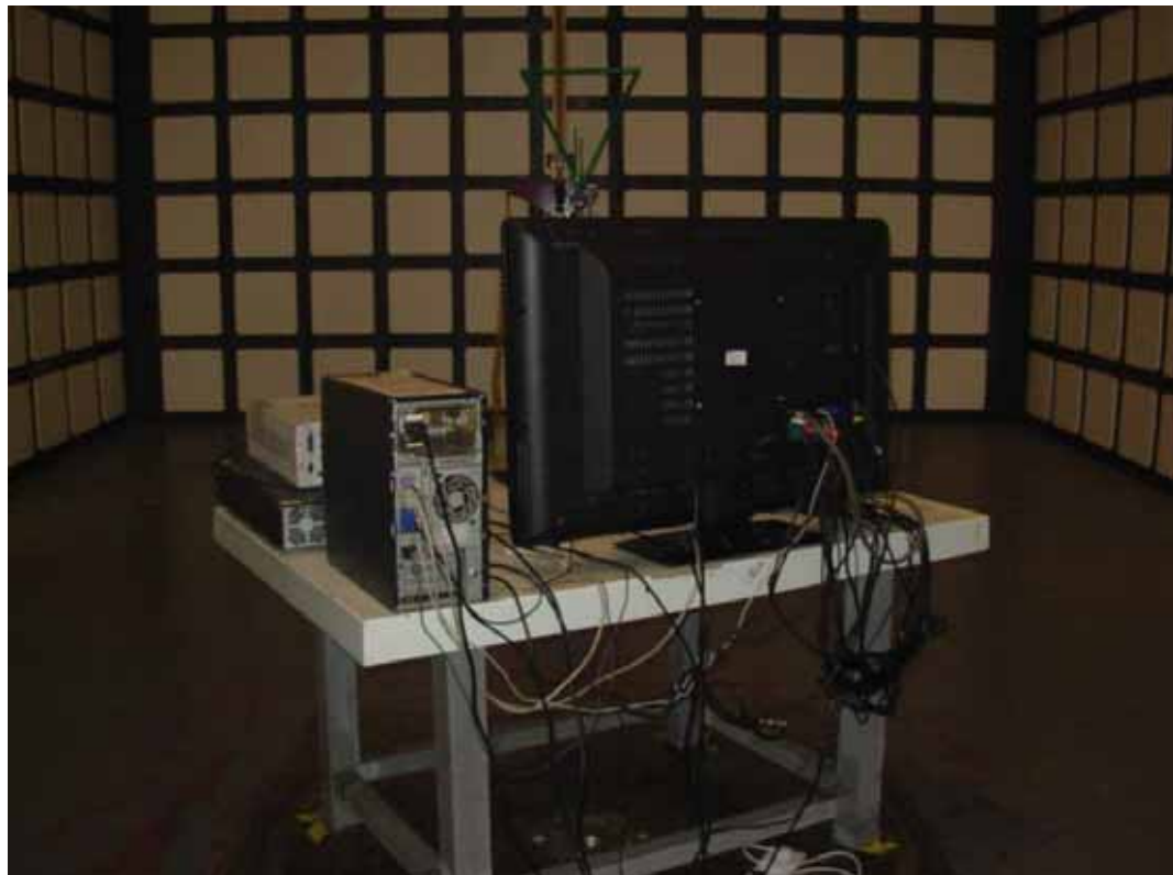
SETUP WITH MAXIMUM DETECTED EMISSION AT VERTICAL POLARIZATION (D-SUB 1024*768@60Hz)