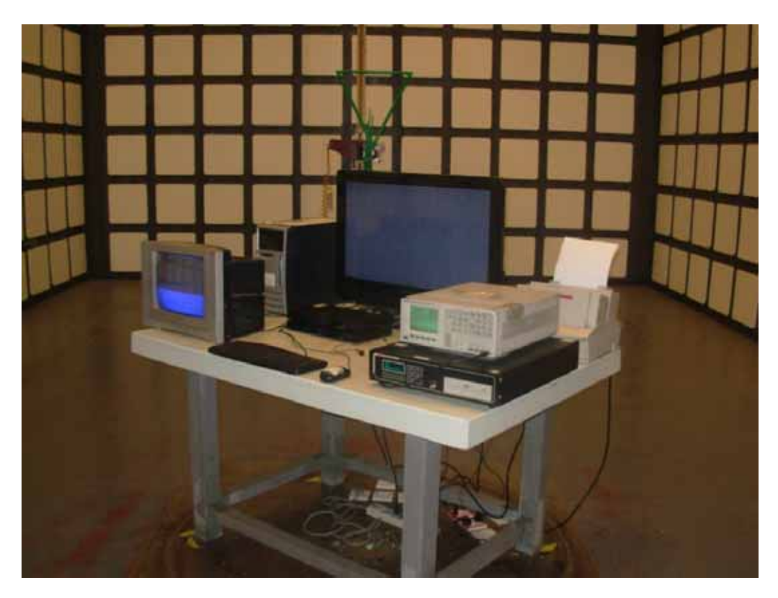
Setup with Maximum Detected Emission at Vertical Polarization (D-Sub 1360*768@60Hz)