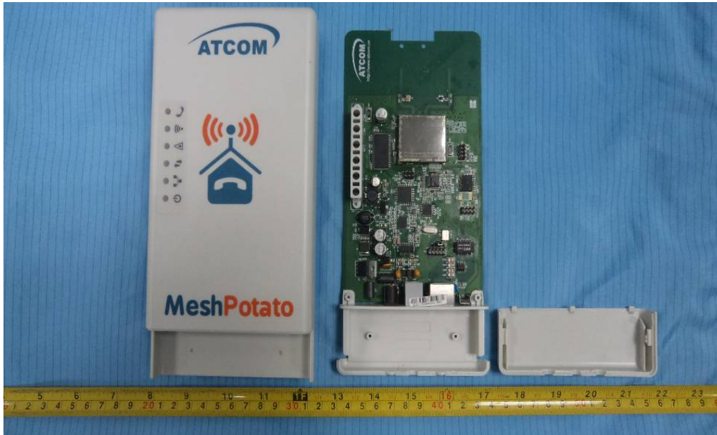
EUT – Main Board Top View