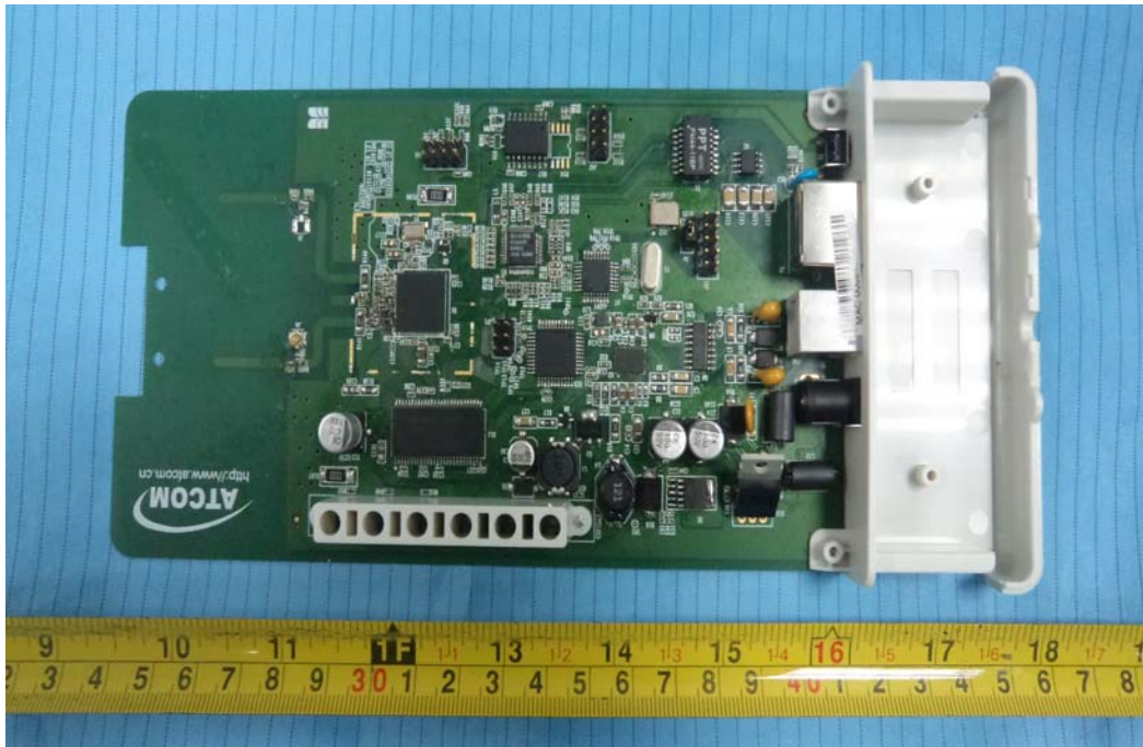
EUT – Main Board Bottom View