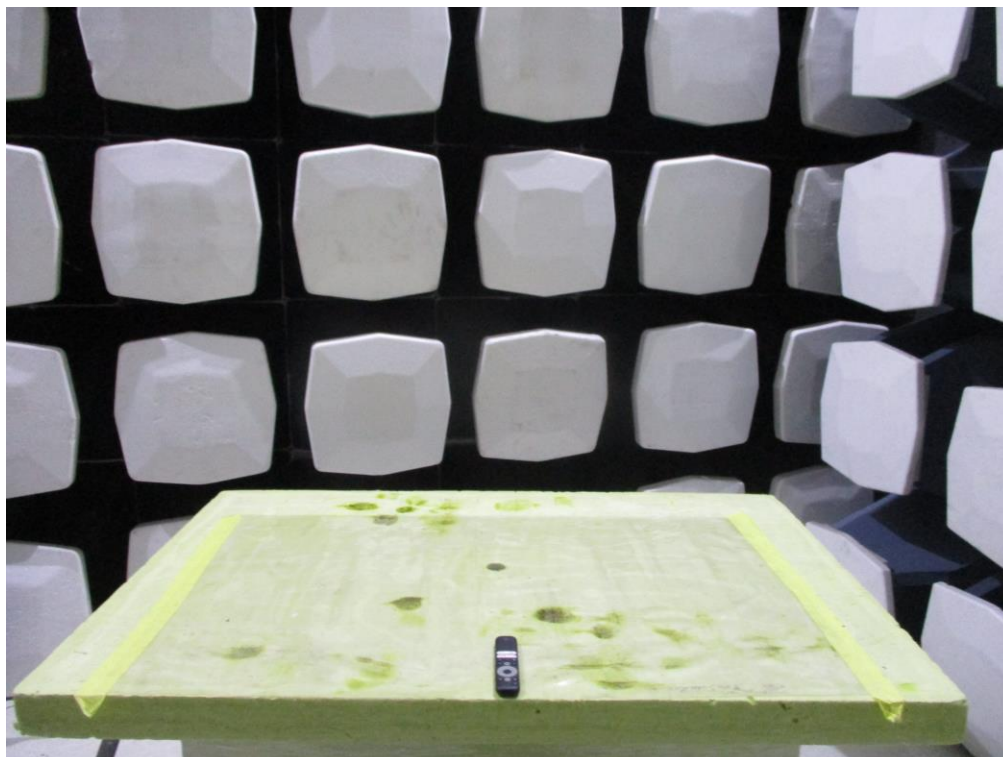
Below 1GHz: EUT is placed on the center of the turn table