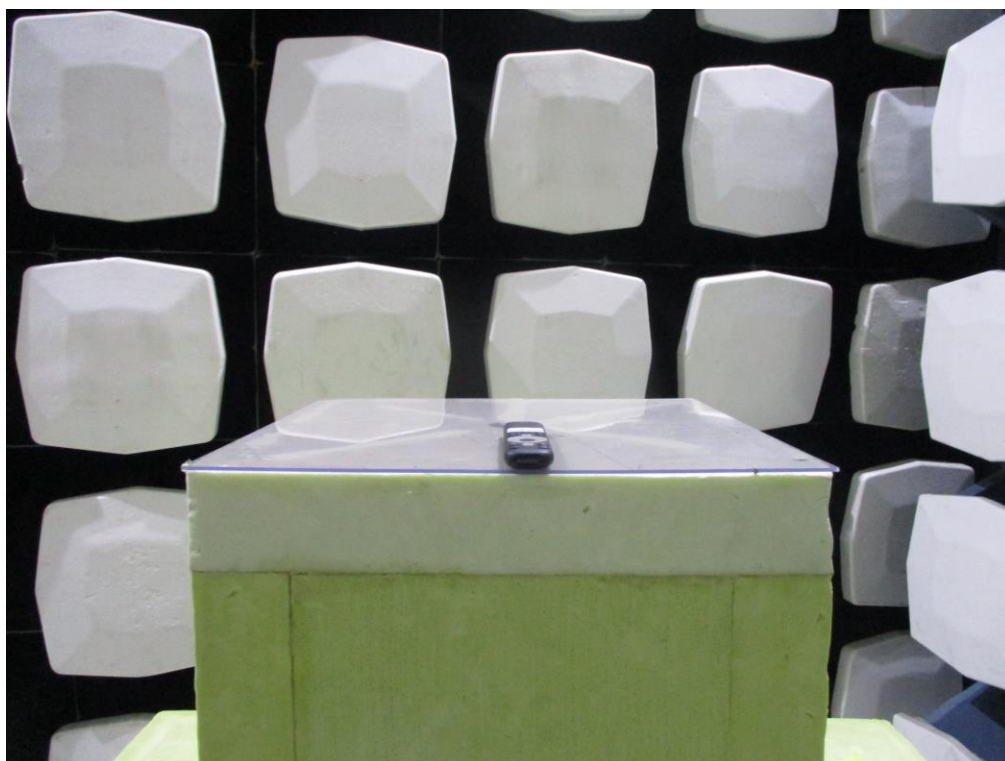
Above 1GHz: EUT is placed on the center of the turn table