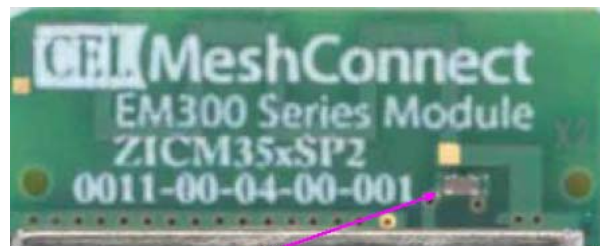
Capacitor C25 is placed vertically to use PCB trace antenna.