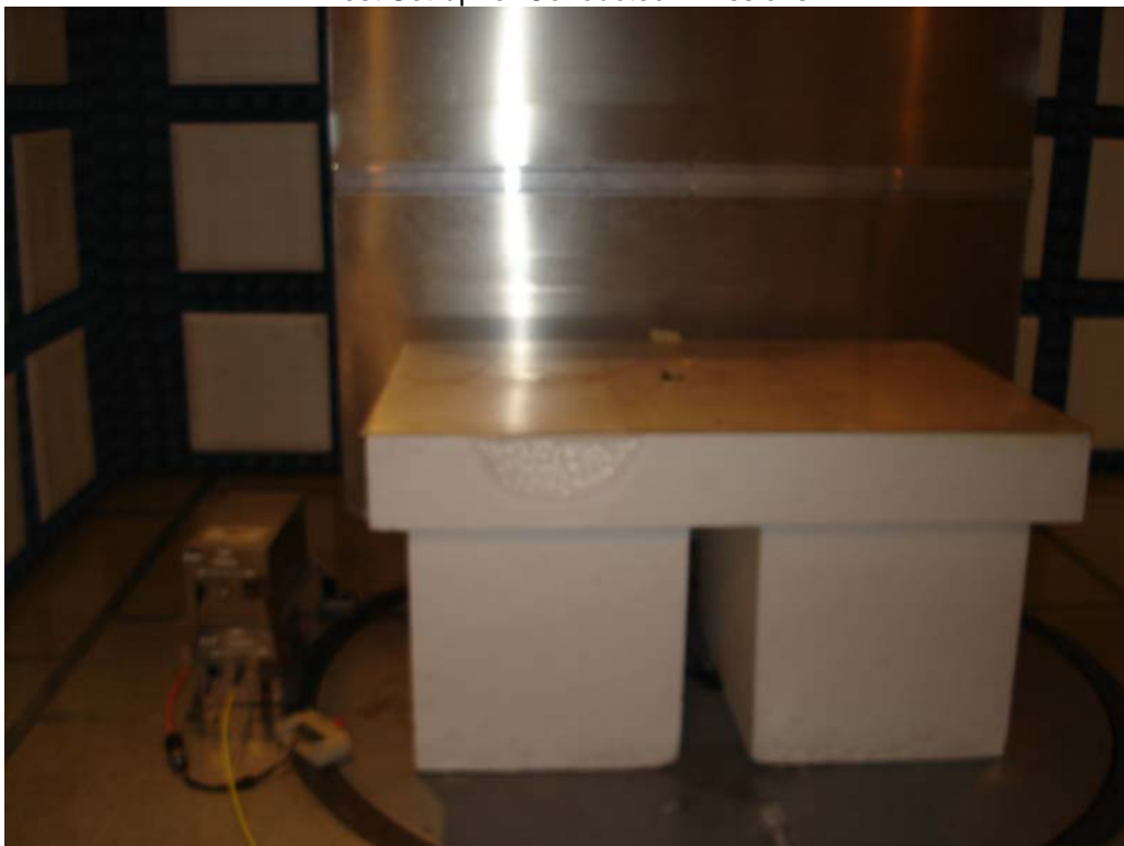
Test Set-up for Conducted Emissions