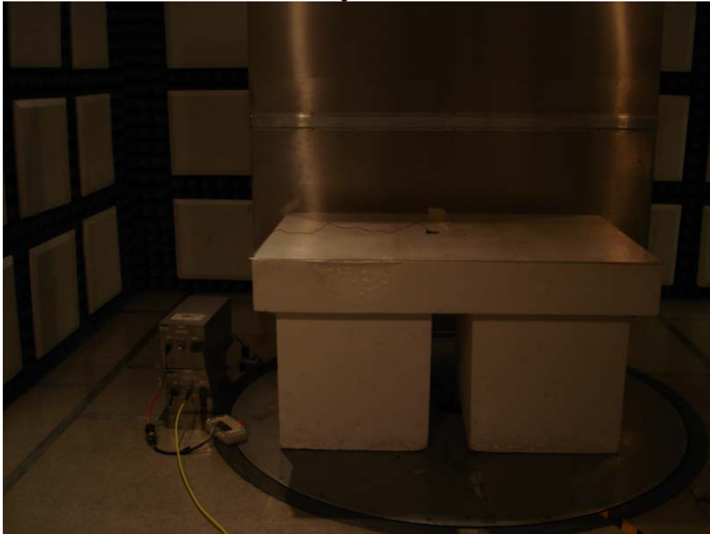
Test Set-up for Conducted Emissions