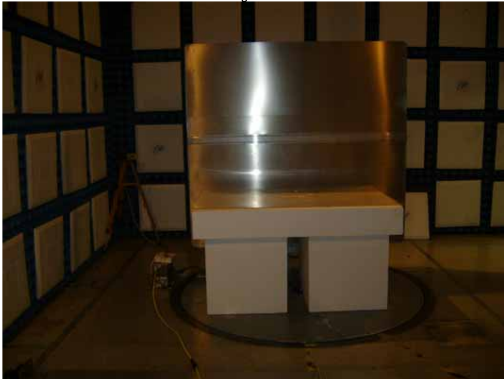
Test Setup for Conducted Emissions