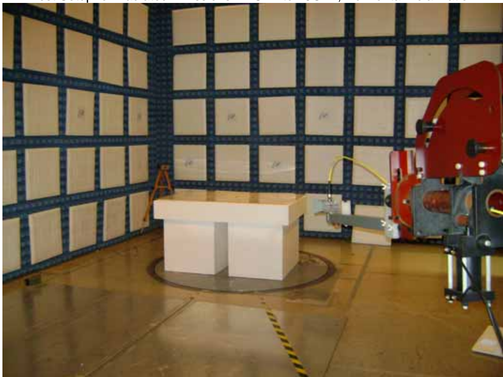
Test Setup for Radiated Emissions – 2GHz to 18GHz, Vertical Polarization