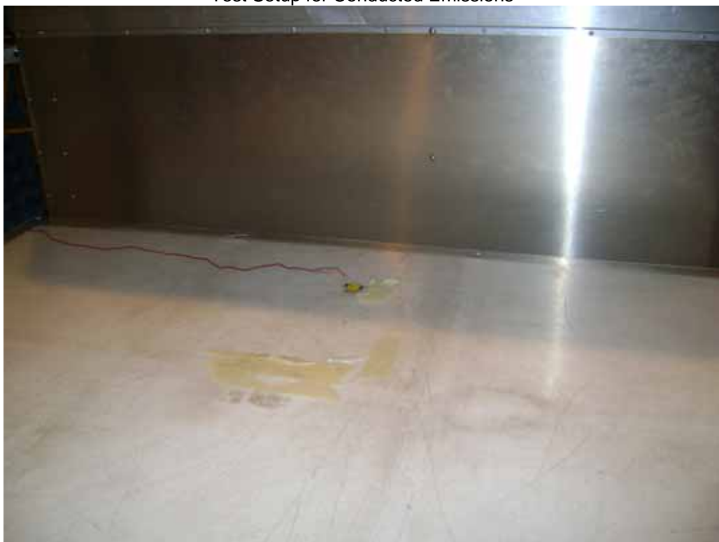
Test Setup for Conducted Emissions