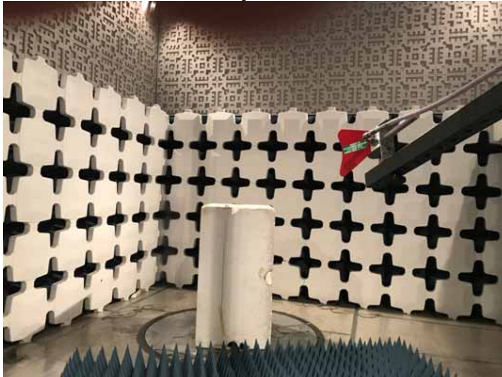
Test Setup for Radiated Emissions – 1GHz to 18GHz, Horizontal Polarization