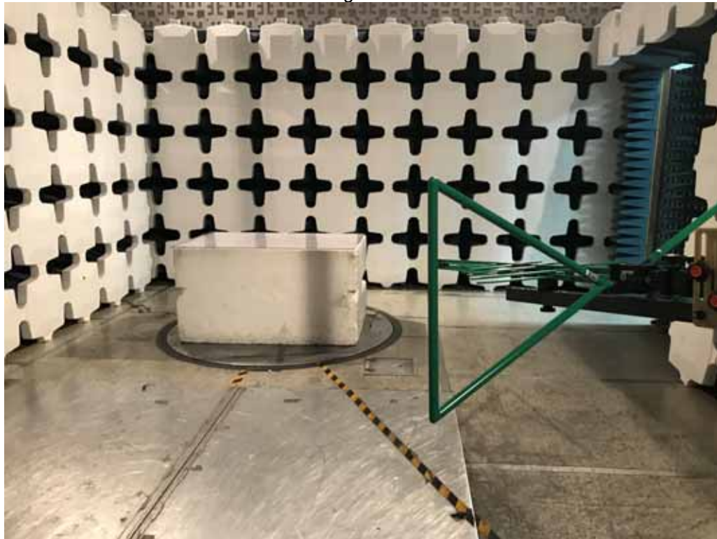
Test Setup for Radiated Emissions – 30MHz to 1GHz, Horizontal Polarization