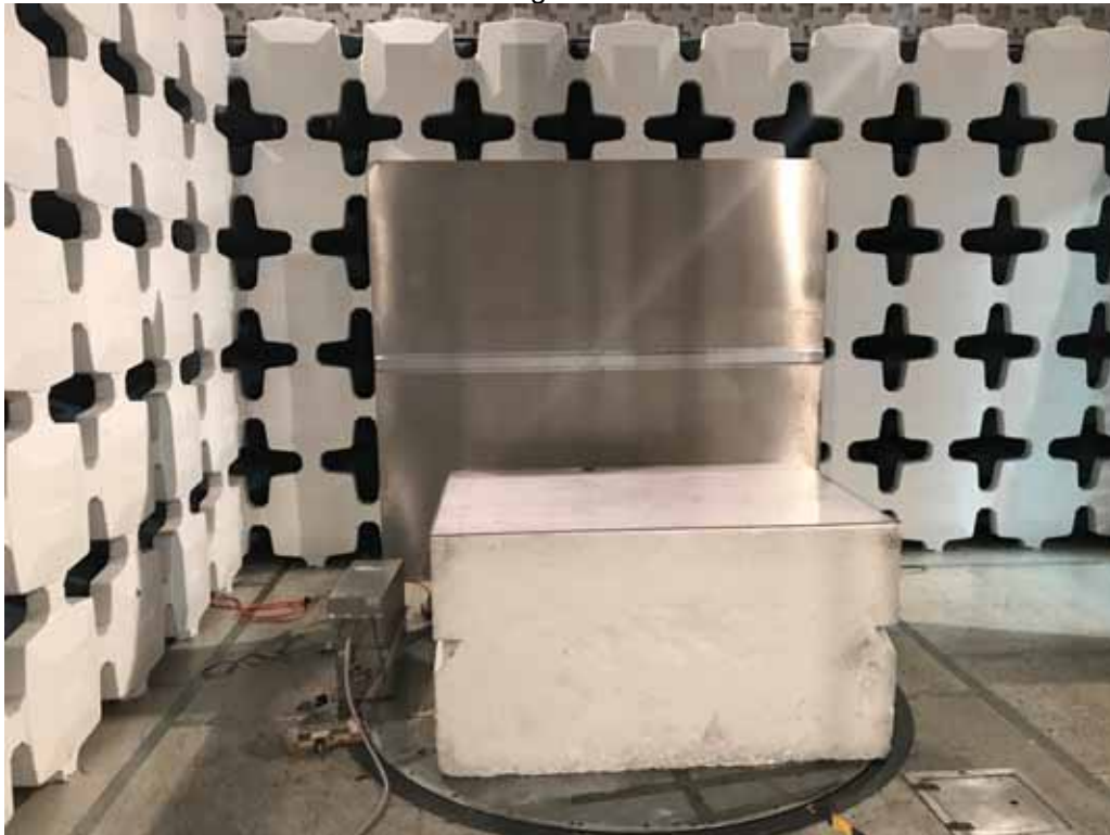
Photograph of the Conducted Emissions Setup