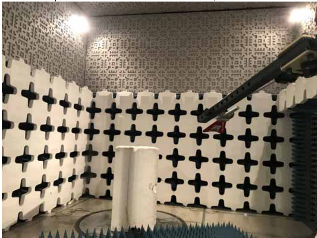
Test Setup for Radiated Emissions – 1GHz to 18GHz, Vertical Polarization