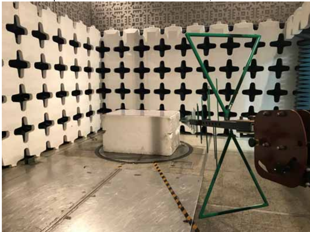
Test Setup for Radiated Emissions – 30MHz to 1GHz, Vertical Polarization