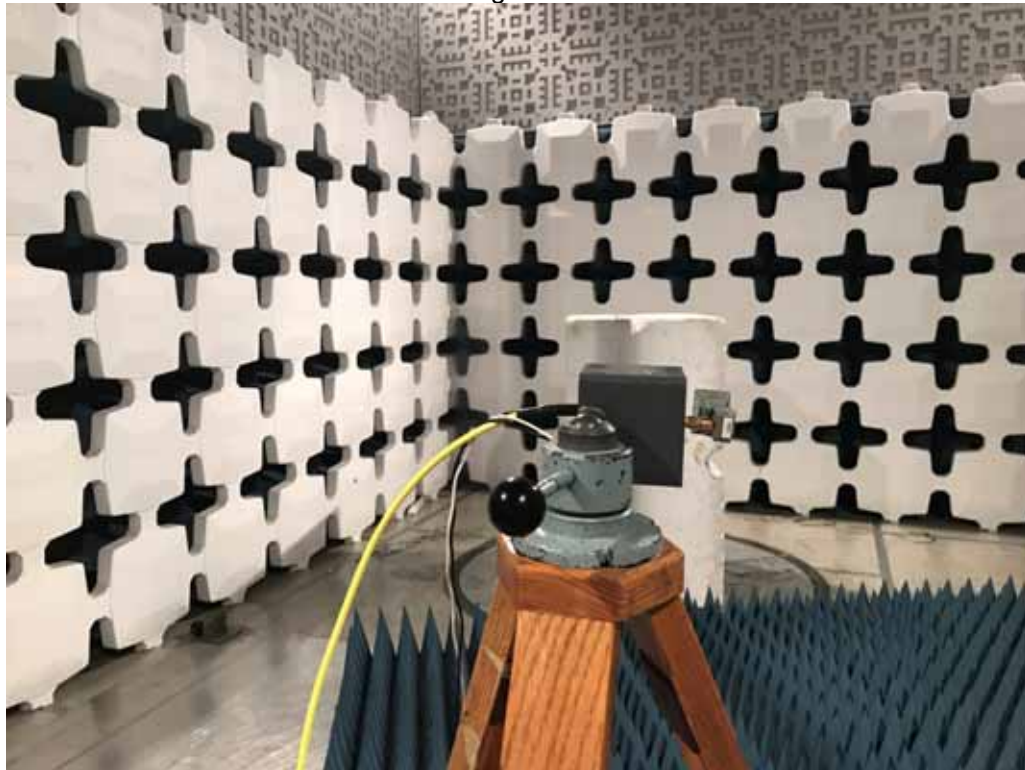
Test Setup for Radiated Emissions – 18GHz to 25GHz, Horizontal Polarization