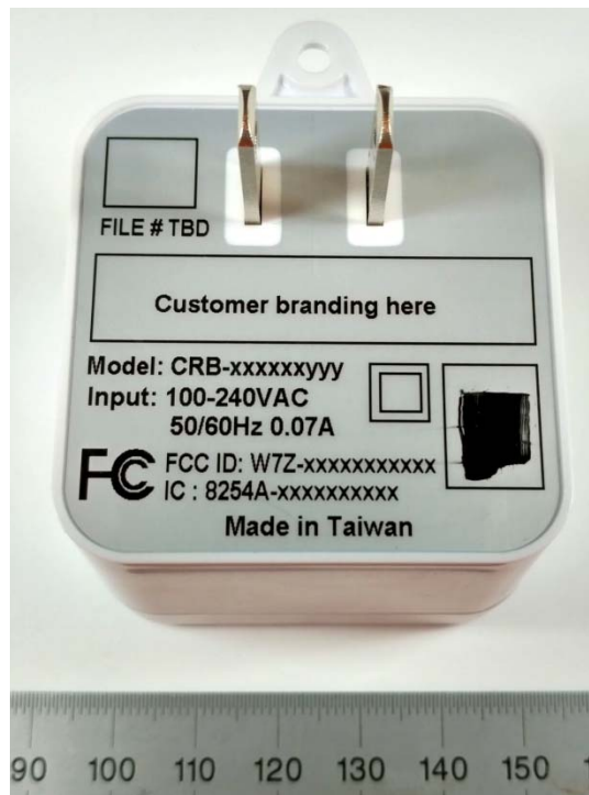
Figure 2. Location of label