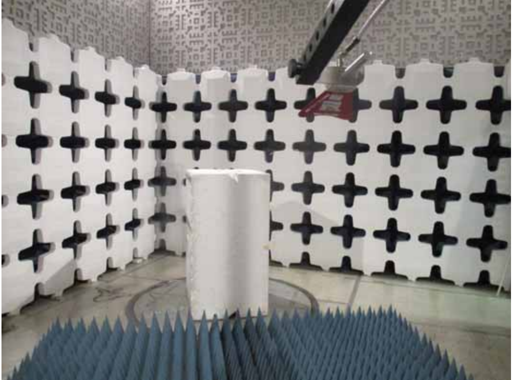
Test Setup for Radiated Emissions – 2GHz to 18GHz, Vertical Polarization