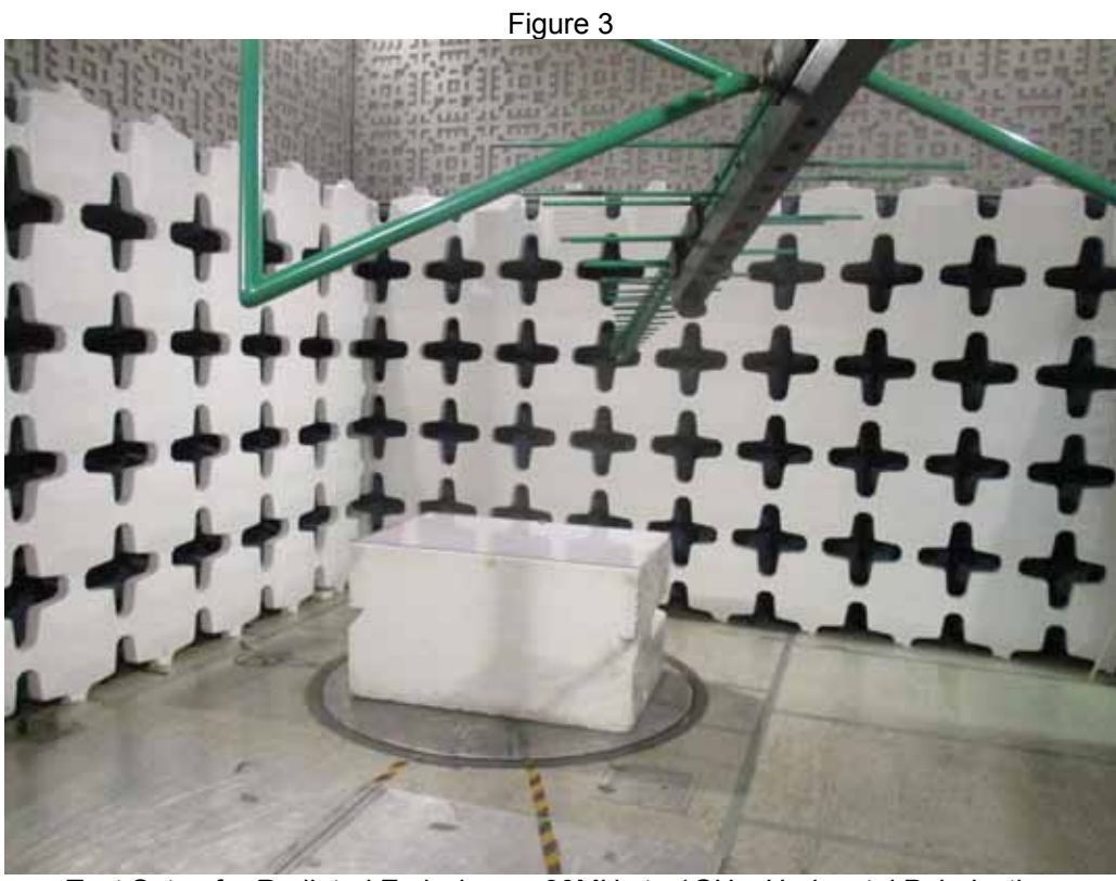
Test Setup for Radiated Emissions – 30MHz to 1GHz, Horizontal Polarization