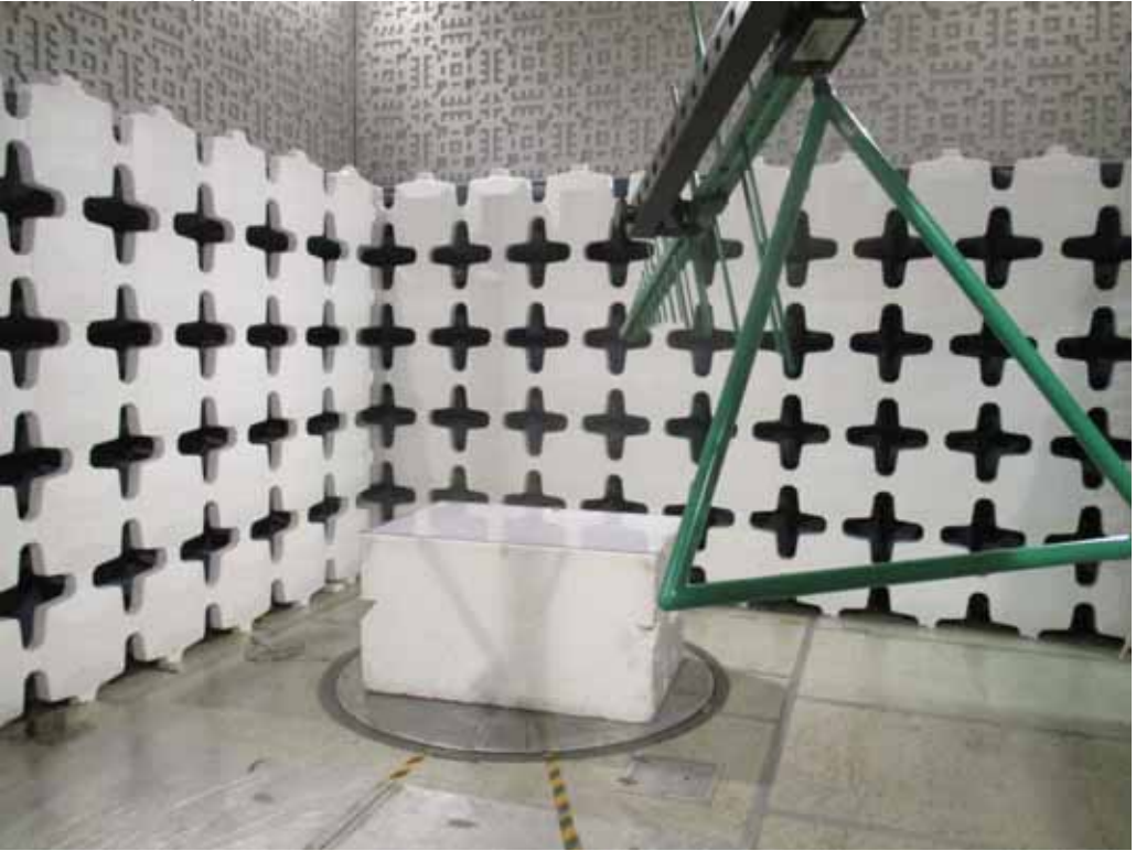
Test Setup for Radiated Emissions – 30MHz to 1GHz, Vertical Polarization