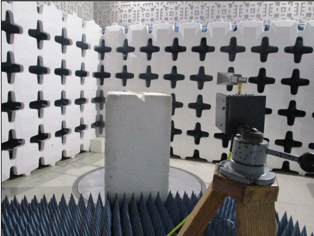
Test Setup for Spurious Radiated Emissions, 18GHz to 25GHz – Antenna Polarization Vertical