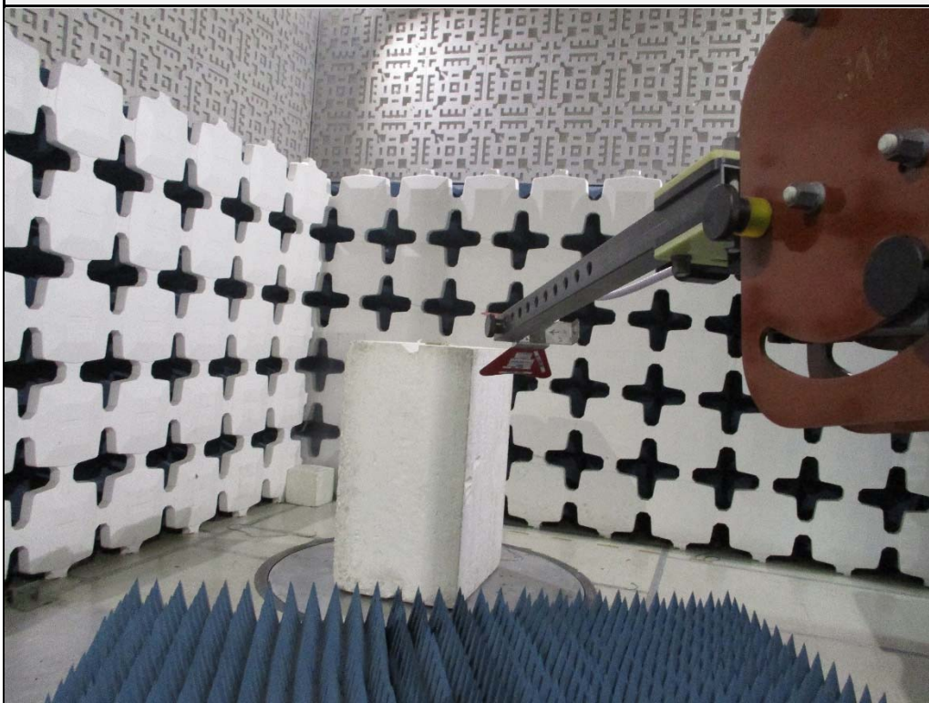
Test Setup for Spurious Radiated Emissions, 1GHz to 18GHz – Antenna Polarization Vertical