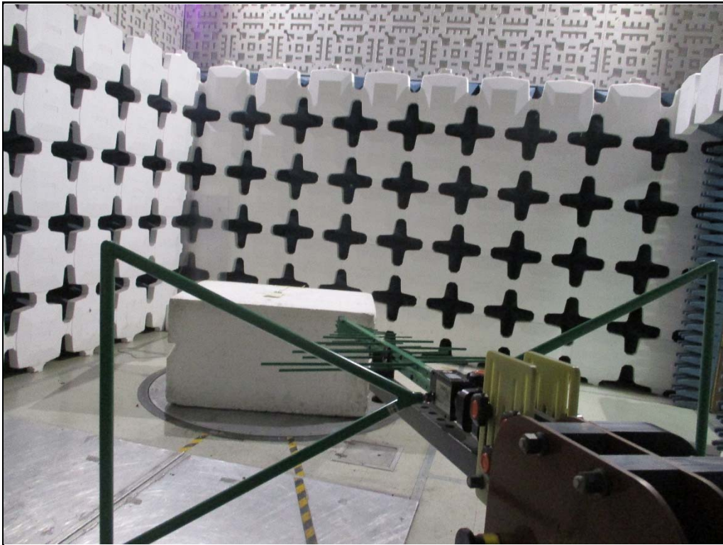
Test Setup for Spurious Radiated Emissions, 30-1000MHz – Antenna Polarization Horizontal