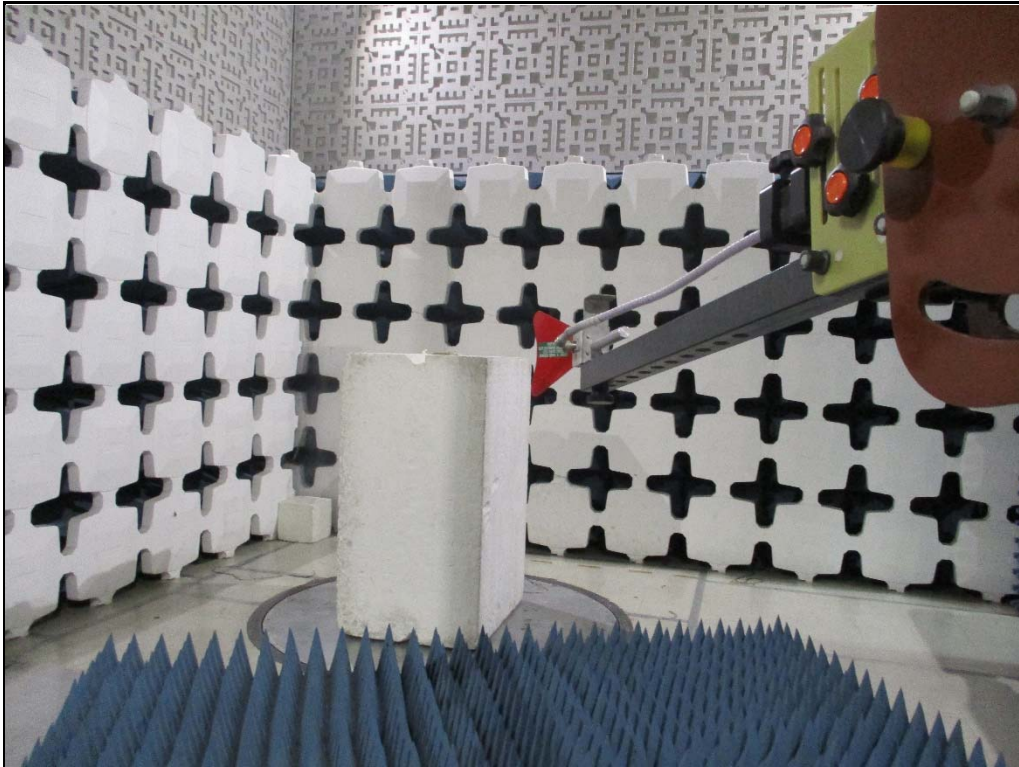
Test Setup for Spurious Radiated Emissions, 1GHz to 18GHz – Antenna Polarization Horizontal