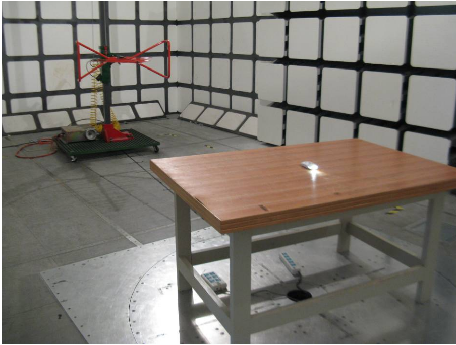
Below 1 GHz: Radiated Emission – Rear View (Transmitting mode)