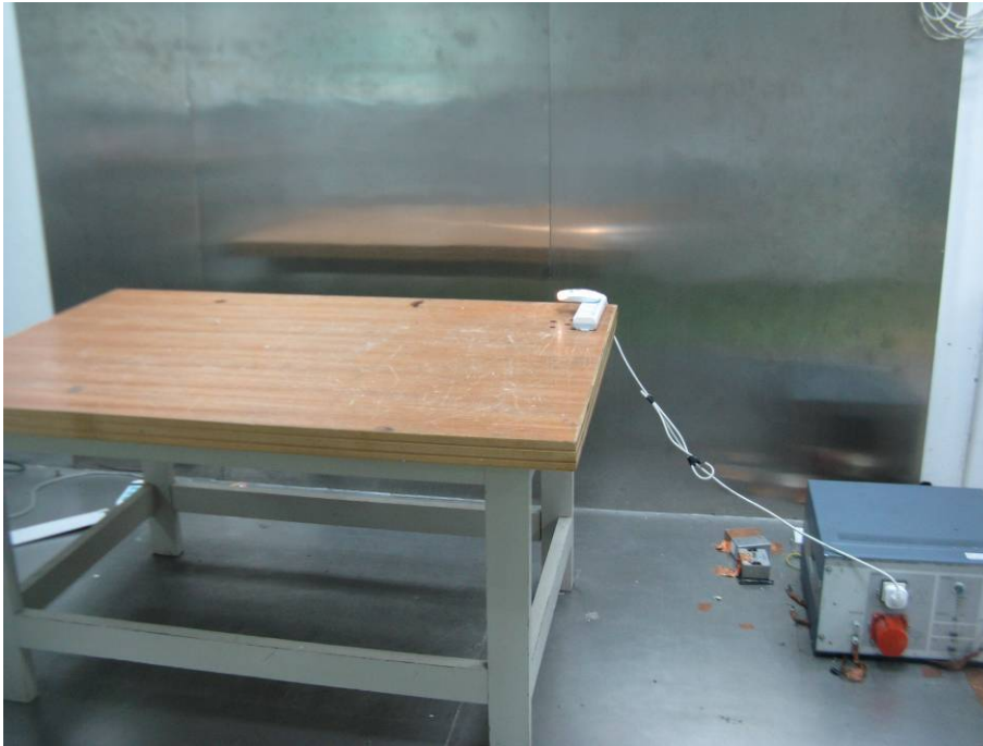
Conducted Emission – Side View