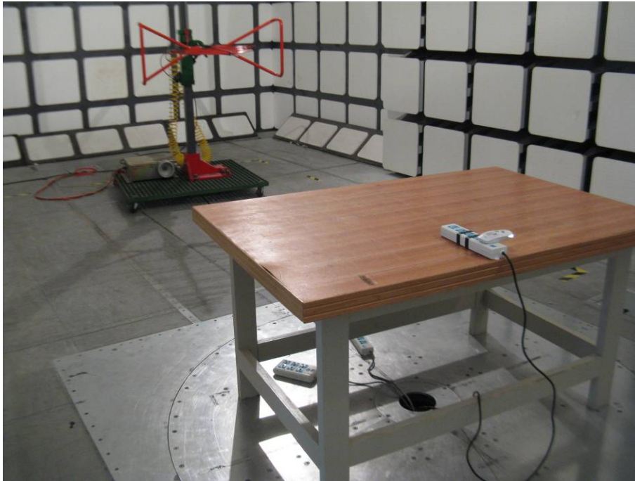
Below 1 GHz: Radiated Emission – Rear View (Charging mode)