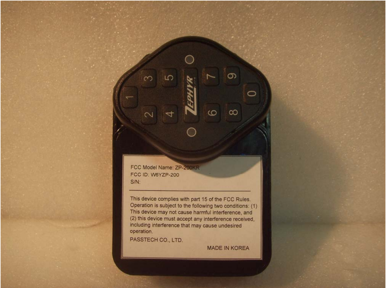
Figure 1.2 LABEL LOCATION

The label shown shall be permanently affixed at a conspicuous location on the device and be readily visible to the user at the time purchase.(Labeling requirements per 2.925)